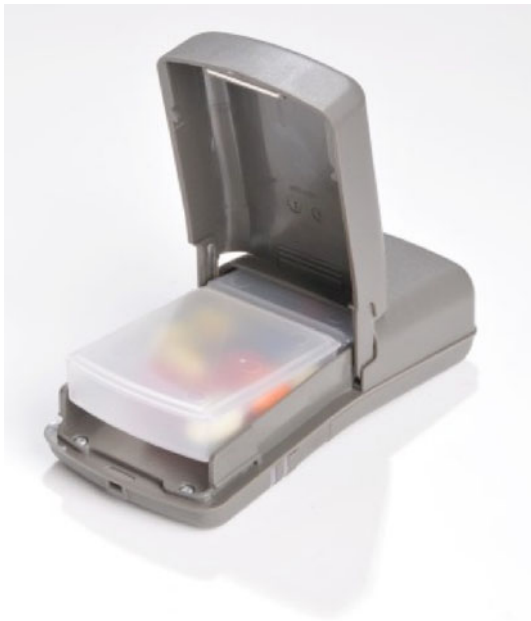
Fig. 1 The Wisepill device

dosing behavior in real-time by transmission of a patient identifier and date-time stamp over existing cellular networks when the container is opened to take medications. Similar real-time monitoring devices are being pilot tested for various healthcare uses, such as infection control and oral hygiene, in developed settings [4, 5]. Because cellular network coverage is becoming ubiquitous globally [6], including large segments of Africa, the technical infrastructure now exists for real-time adherence monitoring in resource-limited settings. While excitement abounds for wireless technologies to support healthcare delivery, especially in developing settings, few studies have provided evidence of feasibility, acceptability, and performance [7].