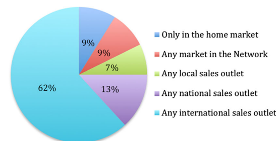
Fig. 3 Producer opinion on the geographical reach of the PGS label

market access could be perceived as contrary to the promotion of a food sovereignty-based vision of locally-based production-consumption chains; however, the Via Campesina has made clear that food sovereignty should not be viewed as a complete rejection of non-local trade, but rather as a declaration that such trade must be conducted within a framework not governed by conventional relationships of domination (Patel 2009). Seen through this lens, the use of a grassroots-based alternative to conventional organic certification may be viewed as a concrete example of how actors who have been marginalized by the global market system can potentially enter that very system on their own terms.