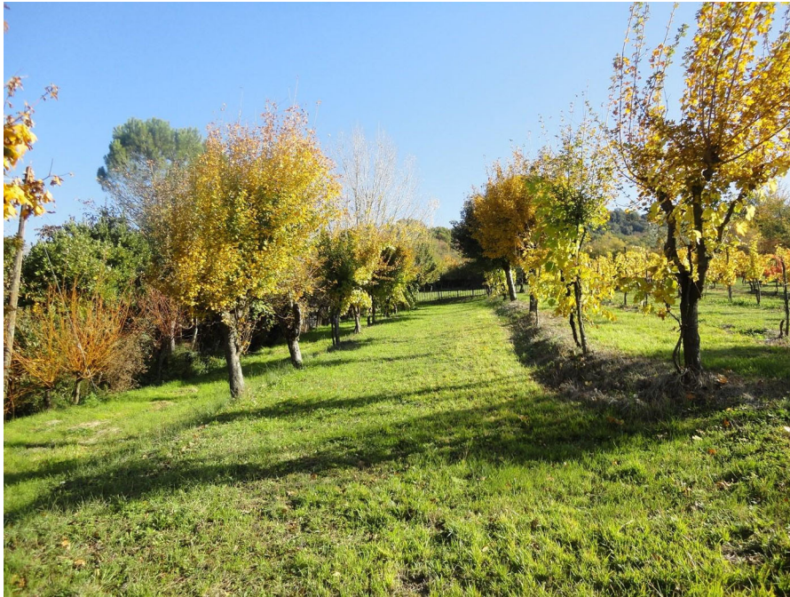
Fig. 2 Coltura promiscua in a hilly area of central Italy with maple trees ( Acer campestre L.) along terrace ridges supporting grapevine and with hay intercropping in between the trees.

in the Po valley, creating diverse veritable “landscapes of trees” (Meynier 1958).