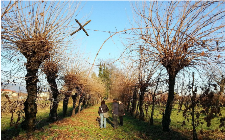
Fig. 3 Coltura promiscua in the fertile alluvial area of northern Italy with poplar trees supporting grapevine. Trees crown is periodically lopped for reducing the shade on the understory.

Pruning was used in the past for fuelwood, hay (fresh shoots with leaves), and basketwork.