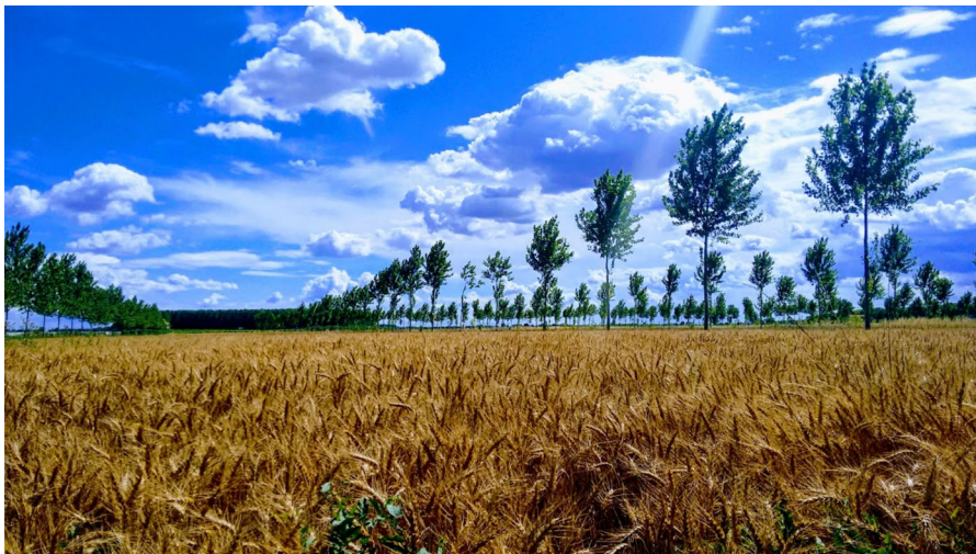
Fig. 4 Linear planting of poplar and oak along drainage ditches in Masi (Padova), Italy.

Pruning was used in the past for fuelwood, hay (fresh shoots with leaves), and basketwork.