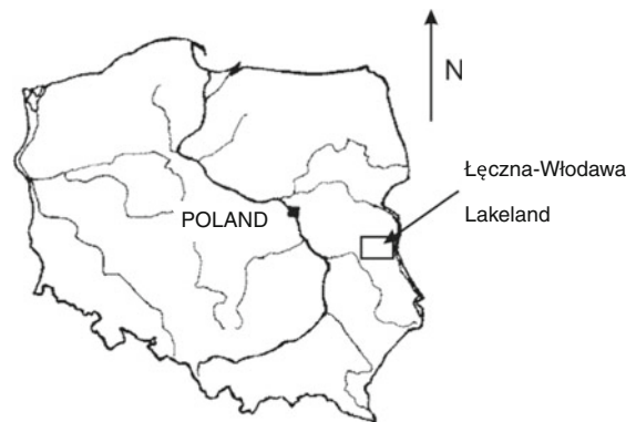
Fig. 1 Location of Łęczna-Włodawa Lakeland and Lake Syczyńskie

Lake Syczyńskie is located in the Łęczna-Włodawa Lakeland, within the Cretaceous elevation of the Chełm Hills (518170N and 238140E) (Fig. 1). It is small (surface area 5.71 ha) and shallow (maximum depth 2.9 m) with two small inflows and one outflow. The lake's southern shore is adjacent to a carbonate peatland. The other part of the lake borders on the small village Syczyn. The lake's drainage basin is relatively large (458.2 ha) in relation to the lake's surface area. This results in the high value of the Ohle's index (80.2). This index (quotient of total drainage area and lake area) measures a potential magnitude of the pressure exerted by a drainage basin on a lake; the higher the value of a lake index, the