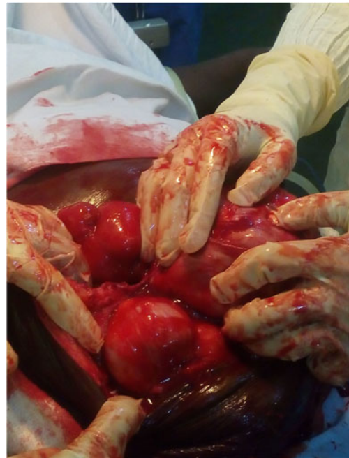
Fig. 4 Point of attachment of the content of the hernia to the fundus of the uterus

defined and opened and a huge sessile fibroid located on the fundus of a bulky uterus was found lying outside the sac. Adhesions with parietal peritoneum were released. The bladder was catheterized and dissected free from the uterus; planes were defined and a subtotal hysterectomy with bilateral salpingo-oophorectomy was performed. Extra margins of sac with extra-peritoneal fat were excised. The large abdominal