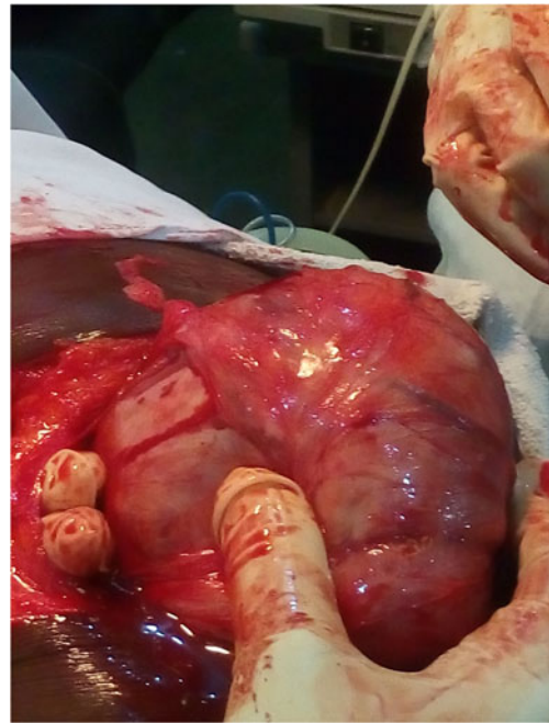
Fig. 3 Fingers of the surgeon forced in between the neck of the hernia sac and the content

defined and opened and a huge sessile fibroid located on the fundus of a bulky uterus was found lying outside the sac. Adhesions with parietal peritoneum were released. The bladder was catheterized and dissected free from the uterus; planes were defined and a subtotal hysterectomy with bilateral salpingo-oophorectomy was performed. Extra margins of sac with extra-peritoneal fat were excised. The large abdominal