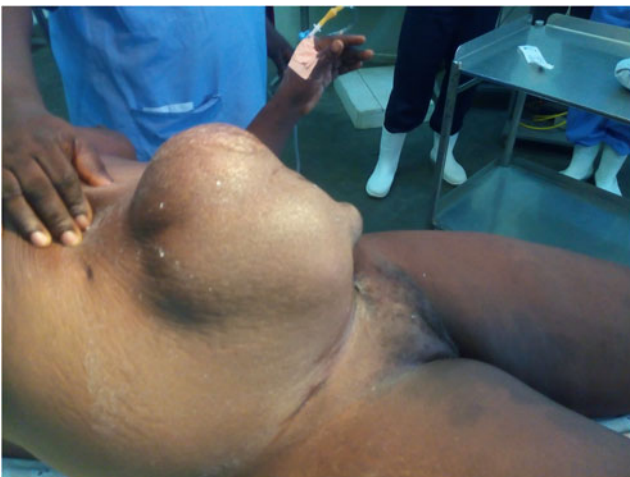
Fig. 2 Irreducible hernia content with patient in supine position

Under spinal anaesthesia converted to general anaesthesia through a mid-line supra-umbilical incision, the sac was