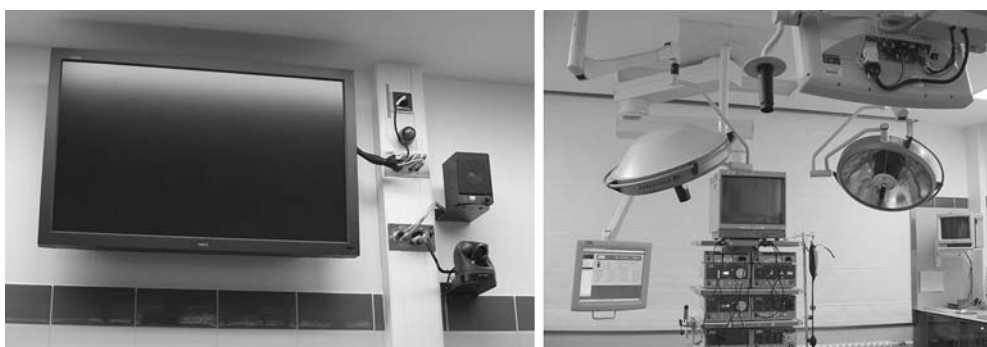
Fig. 2 Systems integration in an operating room at the Department of Obstetrics and Gynecology, University of Tübingen. Room functioning, total endoscopic equipment and the Advanced Image and Data Archiving System (AIDA system) are networked to the

Due to these advantages, the PACS extension is preferable to other archiving concepts. Because of the interconnection of PACS and CWS, physicians get workstation-independent, rapid access to patients’ image data.