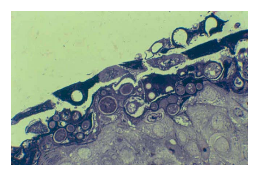
Figure 3. Micrograph of a hematoxylin and eosin-stained histological slide of formalin-fixed tissue of an individual of T. acutirostris from the last remnant wild population. This micrograph clearly shows keratinaceous epithelial cells on the surface of the skin infected with B. dendrobatidis , the causative agent of amphibian chytridiomycosis. The hyperkeratosis and hyperplasia associated with this infection were cited as the cause of death by the veterinary pathologist investigating this case (Berger and Speare, personal communication).

to lack of recovery and the subsequent finding of only two live individuals, indicate that chytridiomycosis was responsible for the decline and extinction of the last subpopulation of this species. This fits with the first criterion for extinction by infection listed above and suggests that infectious disease acted as the proximate and likely ultimate cause of extinction of T. acutirostris .