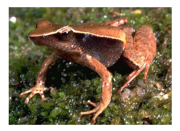
Figure 2. A photograph of T. acutirostris from the last remnant population prior to the collection of chytridiomycosis-positive individuals.

at Big Tableland during the 1993 season. In another 1993 study at Big Tableland, sick and dying anurans (including T. acutirostris ) were collected for pathological examination and tested positive for the chytrid fungus (Berger et al., 1999).