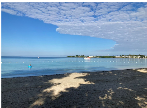
Fig. 3 This sea level optical biopsy cartoons the idea of the author, that life always aims to outbalance fascinating interests between conflicting states of affair (dualities), such as water (sea) and beach (land), as outlined in the text