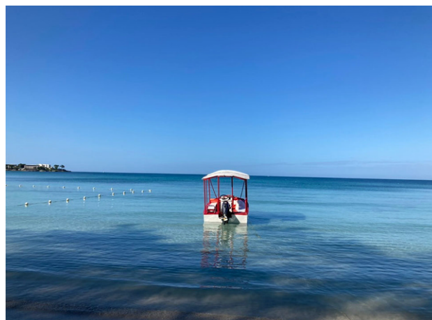
Fig. 2 This optical biopsy cartoons the idea of the author, that we are the manifestations (i.e. boats) of the universal cosmic field, as outlined within the text. Image obtained at sea level

change up to the large scale hunter/gatherer race/competition of all life and all the moons, stars and galaxies around us. We are all made up out of this idea, this is why European Surgery cares about it. As such nature may note that we exist.