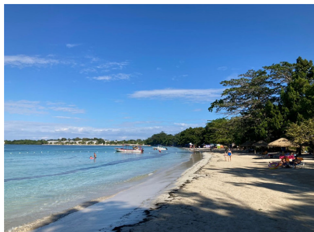
Fig. 4 This optical biopsy cartoons the idea of the author, that differences motivate tensions. Art (medicine, surgery, story telling, musics etc.) aims to outbalance and harmonise these imbalances in order to foster health, wellbeing and joy, as outlined in the text

concepts and strategies for the multidisciplinary diagnosis, treatment and follow up of diseases. This is why editorials published in European Surgery worry about these topics and themes. We have to care for the future of our minds. We have to open the eyes for limits, borders and tensions (Fig. 3).