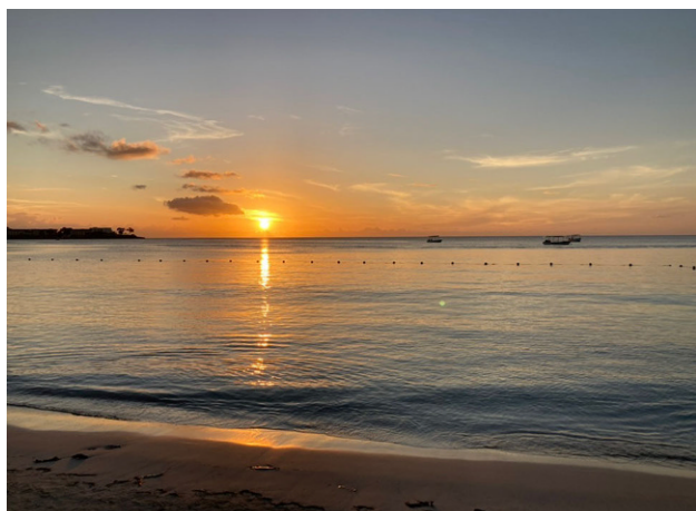
Fig. 1 This wild life optical biopsy cartoons the idea of the author that any perception equals the translation of an actual atmosphere, which decides on how and why we deliver any focus of interest. Immune staining has not been applied