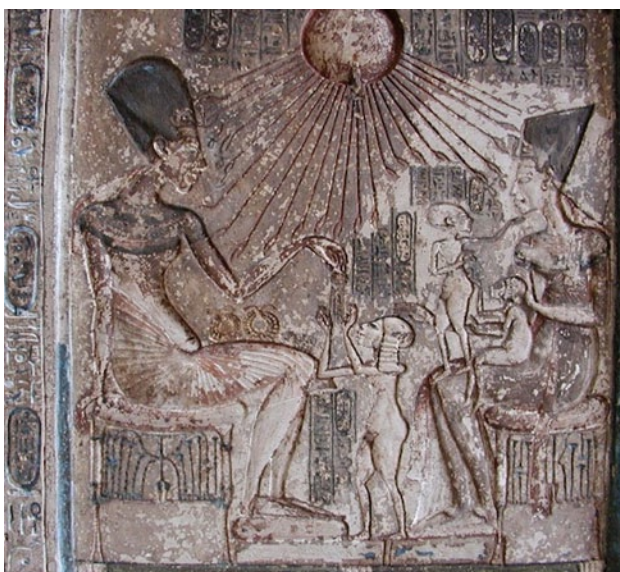
Fig. 2 The ancient Egyptian pharaoh Akhenaten, his wife Nefertiti and children under the life spending energy of the sun god Aten (around 1340 B.C., Amarna period, eighteenth dynasty). The image mirrors the idea of the author, that the sun disc represents the unknown, misty, hidden global power, which is indicated by the arms, conducts remote control of the humans to induce, satisfy and define their life and existence. At present the sun disc would represent the world power lobby creating immense economic profit by serving the satisfaction of the needs raised by the archaic human qualities (= archaiconomy ), as depicted in Table 1 and described in the text. Image obtained from the Egyptian museum, Cairo (Nr. JE 44865)

May it be that the unidentifiable invisible power has already been brilliantly mirrored by the ancient Egyptians in the form of the sun disc spreading out the all-controlling and manipulating arms leaving humans in blindness, dependence and insecurity (Fig. 2)? Even the king, the pharaoh, with his family, wife, kids, temples,