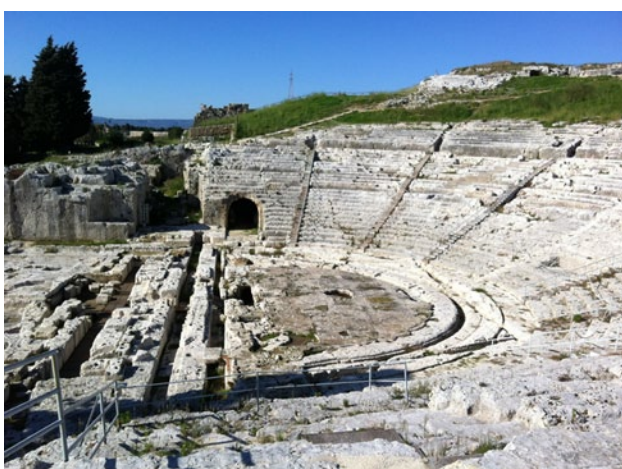
Fig. 1 Image obtained at the ancient Greek theater of Siracusa, Sicily, Italy, Europe, where man used to stage the essence of his being in order to bridge the boredom of his existence, as described in the text

within the chamber of ready roots upon legacy: river runs without Heraclitus belly bridges to coast, mantle the Parmenides sea well water drop temper taste tick tangles the Anaximander ocean, gently wipes the waves into the Platon nutshell nature glory big biter board bubble builder in rim ram James nobody Joyce arms as previously described by here comes earth ( p < 0.05 ).