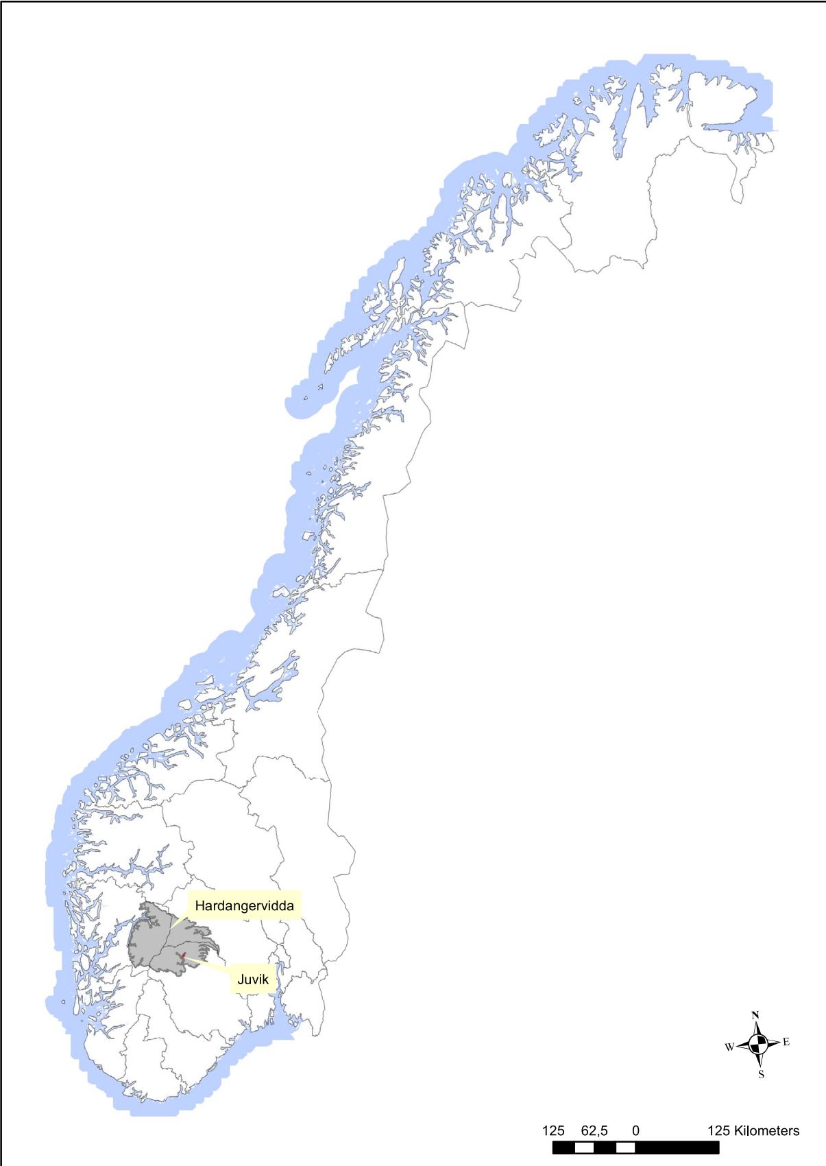
Fig. 1 The position of the mountain plateau Hardangervidda (grey area) and the focal estate Juvik in southern Norway