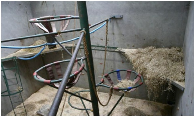
Fig. 4 Elevated “pods” were never used for sleeping by chimpanzees; the elevated platforms were preferred sleeping sites

highest floor area available in a multi-level enclosure (Lock and Anderson 2013). In view of the increasing number of reports of terrestrial nesting in wild African apes, we are quite relaxed about ground-sleeping in captivity. Indeed, in some facilities underfloor heating or deep litter, may make sleeping on the floor particularly attractive. Alternatively, depending on facility design there may be fewer drafts at ground level than higher up, or vice versa. Again, we emphasize choice. Some facilities provide elevated pods or baskets as potential sleep locations, with variable success: whereas some may be used regularly for nesting (see Fig. 1), others may be completely ignored. The pods shown in Fig. 4 were supposed to offer more naturalistic nesting opportunities to captive chimpanzees, but none has ever been used for sleeping in, probably because they are too small, too deep, and insufficiently firm. By contrast, the chimpanzees habitually sleep at night on the elevated, solid platforms that are also visible in Fig. 1 (Anderson et al. 2010). We suggest that there are now sufficient data available on nest architecture in the wild to improve the design of nest pods or baskets for captive apes, focusing on size, shape, sturdiness/softness, and thermoregulatory affordances.