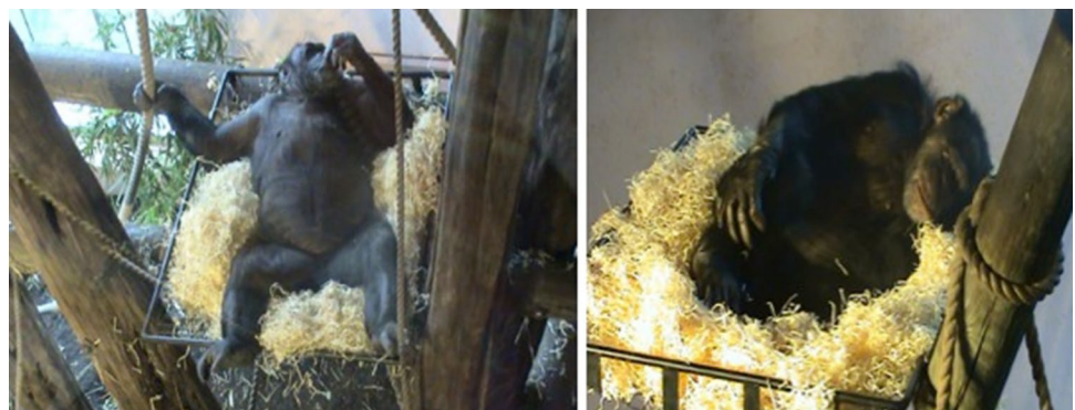
Fig. 1 Although great apes sometimes lie supine in their nest (left), they more commonly lie on one side while sleeping (right)

Video recordings of small captive groups revealed that, like their wild counterparts, adult chimpanzees frequently woke up during the night—on average between 3 and 5 times (Videan 2006b). Waking periods, which accounted for an average of over 20 min each night, were associated with changing sleeping location, vigilance, foraging, drinking, occasional social grooming and even copulation. In the same study, unlike in humans, older adult chimpanzees slept for longer and had higher-quality sleep than younger adults. Videan (2006b) suggested that this human–chimpanzee