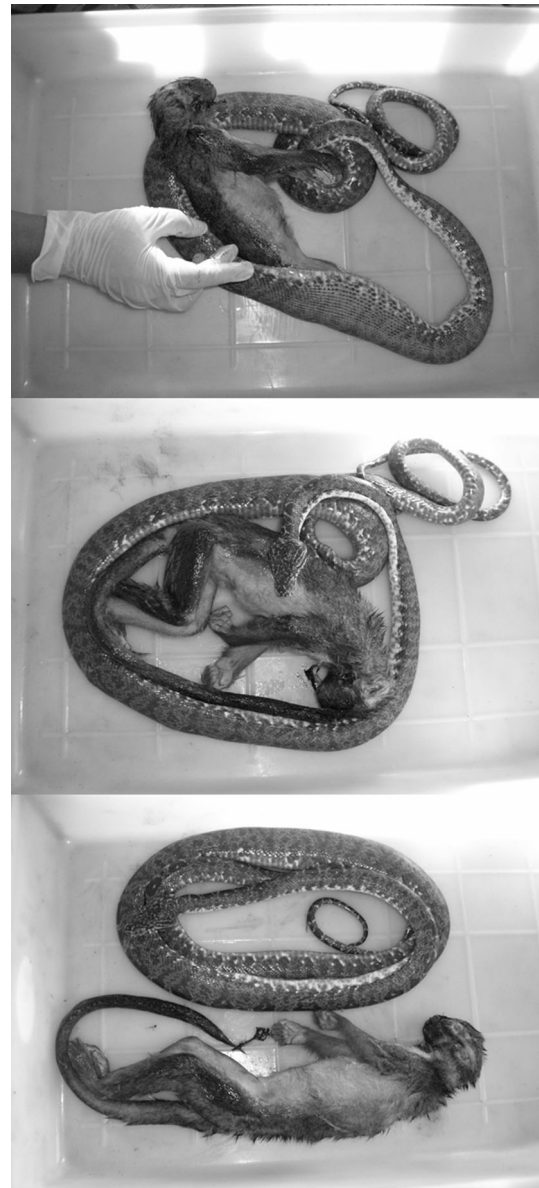
Fig. 2 Analysis of the stomach contents of the specimen of C. hortulanus (adult female; IEPA 311) showing the squirrel monkey ( S. sciureus ; adult female) still intact

Boid snakes, especially B. constrictor , are known to prey on a wide variety of mammals (Pizzatto et al. 2009) and appear to be a major snake threat to platyrrhine primates such as Alouatta puruensis (Quintino and Bicca-Marques 2013), Callicebus discolor (Cisneros-Heredia et al. 2005), Callithrix penicillata (Teixeira et al. 2016), Cebus albifrons (Defler 1979), Cebus capucinus (Chapman 1986; Perry et al. 2003), Chiropotes utahickae (Ferrari et al. 2004), Leontopithecus rosalia (Kierulff et al. 2002), and Saguinus mystax (Tello et al. 2002). Heymann (1987) also recorded the predation of a moustached tamarin ( S. mystax ) by an anaconda ( Eunectes murinus ). Predation of platyrrhines by the Amazon tree boas ( Corallus sp.) has not been recorded previously, possibly at least in part because