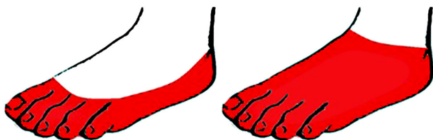
Fig. 3 Illustrative pictures of the difference between primary focal and secondary compensatory hyperhidrosis of the feet. In primary hyperhidrosis of the feet the typical pattern of the affected area is in the shape of a ballerina shoe. Sympathectomy often worsens an already existing primary hyperhidrosis, and widens the area, which results in a pattern of socks

BTX A and BTX B have a similar anhidrotic effect with ratios of 1:1–2 when similar concentrations are used [23, 24]. It therefore seems that BTX B has a weaker effect on \alpha -motor neurons and muscles compared to autonomic sympathetic sudomotor neurons and sweat glands. This discrepancy of effect on cholinergic, somatic, and autonomic fibers can conveniently be used when treating multiple areas of hyperhidrosis, for example CH. In general, BTX A seems to have a longer anhidrotic effect than BTX B at the group level [1, 14, 23], but not necessarily at the individual level. To achieve as long of an effect as possible without systemic side-effects, BTX A was used in small areas such as the feet, and BTX B was used in large areas such as the trunk in the study population. Oxybutynin