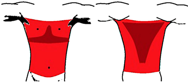
Fig. 1 Compensatory hyperhidrosis of the trunk. This was the most common hyperhidrotic area reported by the patients. The dark red areas shows punctum maximum of the hyperhidrosis

The trunk was the most commonly reported area exhibiting compensatory hyperhidrosis in the study. Four patients (no. 2, 4, 6, and 7) still suffer from hyperhidrosis from the areas on which they originally underwent surgery