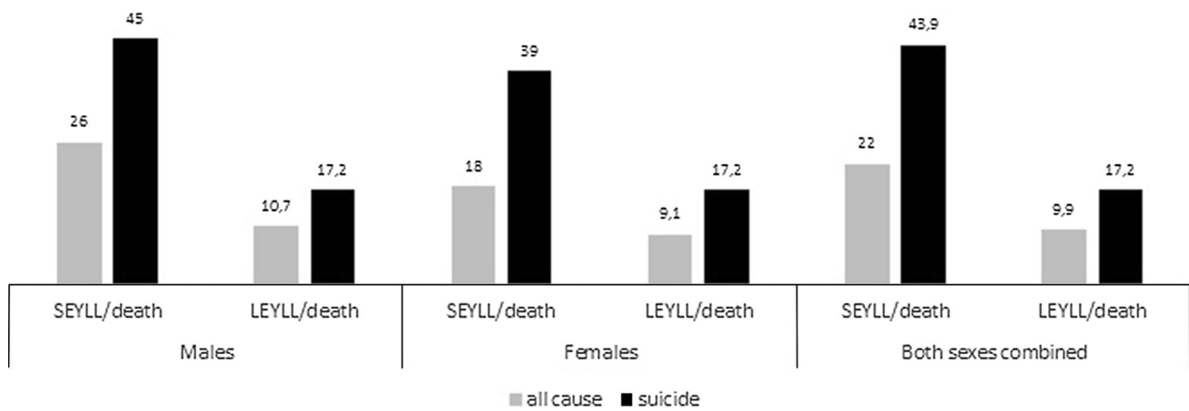
Fig. 3 Comparison between mean suicide-related LEYLL and SEYLL and mean all-cause death-related LEYLL and SEYLL in the Polish population