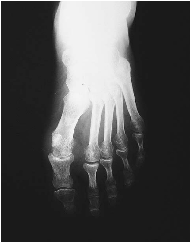
Fig. 2 AP X-ray 36 months later postoperatively; good result