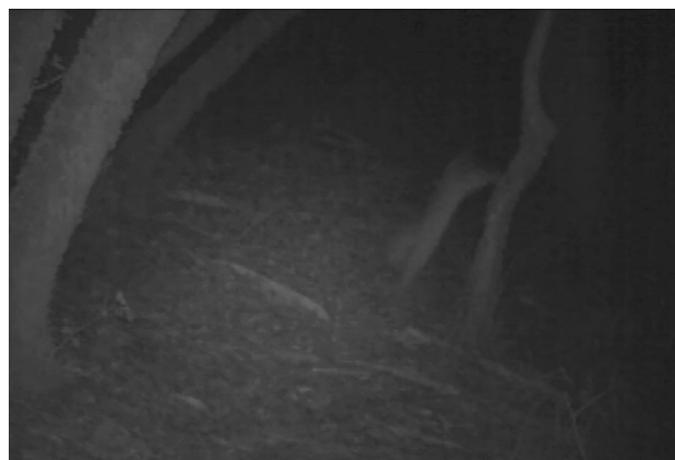
Fig. 6 A video of a gray fox using its tree climbing ability to escape predation by a bobcat

Cascading patterns in the abundance of carnivores, particularly among canines, are known to occur (e.g., Levi and Wilmers 2012). Wang et al. (2015) found a site-specific cascading pattern in the activity patterns of pumas, coyotes and gray foxes, while Allen et al. (2015b) found a cascading pattern in the feeding of carnivores at puma kills. We found a similar cascading pattern in the relative abundance of carnivores at puma community scrapes. Cheek rubbing may be a behavioral response used by gray foxes to deter or escape predation from coyotes and bobcats, as smelling like a large carnivore may deter predation events by meso carnivores long enough for the gray fox to escape (e.g., Garvey et al. 2016). This may be a particular advantage for gray foxes, as their main predation avoidance technique is tree climbing (Fritzell and Haroldson 1982) (Fig. 6, http://www.momo-p.com/showdetail-e.php?movieid=momo160812uc03a ), and hesitation by a larger predator may give the gray fox time to escape into a tree. The giving up densities (GUP) of prey increase in response to predator scent (Bytheway et al. 2013), and the same may be true of carnivores avoiding larger carnivores. This behavior is likely to be most beneficial against larger predators that are smell-dominant, such as coyotes, and we found that gray foxes visited community scrapes 38 times