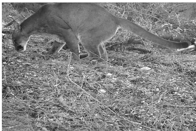
Fig. 1 A video of a puma creating an individual scrape. The area in view of the video is a community scrape

Over the course of 4 years, we documented gray foxes ( Urocyon cinereoargenteus ) visiting scent marking areas termed “community scrapes” (Allen et al. 2014). Community scrapes are scent marking areas used by the carnivore guild (Allen et al. 2015a), including pumas ( Puma concolor ), who use the area for territorial marking and mate selection (Allen et al. 2014, 2015a, 2016). Community scrapes are defined as the broader areas across which scent marking occurs, as opposed to the “individual scrape” created by an individual puma during a scent marking event (Allen et al. 2014) (Fig. 1, http://www.momo-p.com/showdetail-e.php?movieid=momo160812pc01a ). The gray foxes we observed frequently used olfactory investigation and then left urine scent marks at these areas. Less frequently gray foxes exhibited cheek rubbing behavior, where they rubbed their cheek, jaw, and neck on puma individual scrapes or other nearby objects (Fig. 2, http://www.momo-p.com/showdetail-e.php?movieid=momo160812uc01a ). The use of puma community scrapes for scent marking, and particularly the cheek rubbing behavior, by gray foxes suggests some aspect of interspecific scent marking was occurring. We could not find any reference in the literature to interspecific communication through cheek rubbing; thus we examined gray fox behavior of cheek rubbing on puma