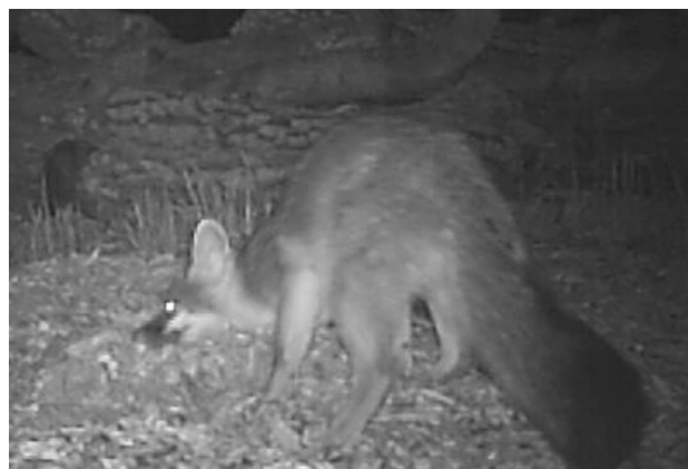
Fig. 2 A video of a gray fox exhibiting cheek rubbing behavior on an individual scrape made by a puma

individual scrapes further to evaluate its functional significance through testing a series of hypotheses.