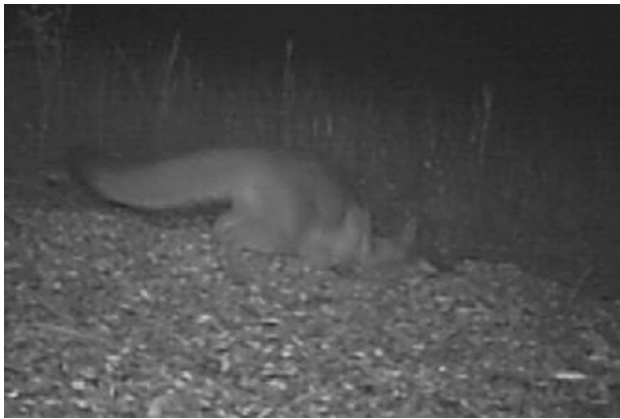
Fig. 3 A video showing a typical sequence of events when cheek rubbing was exhibited. The fox first investigates the puma's individual scrape, follows this by cheek rubbing, and then sometimes urinates on or near the puma individual scrape