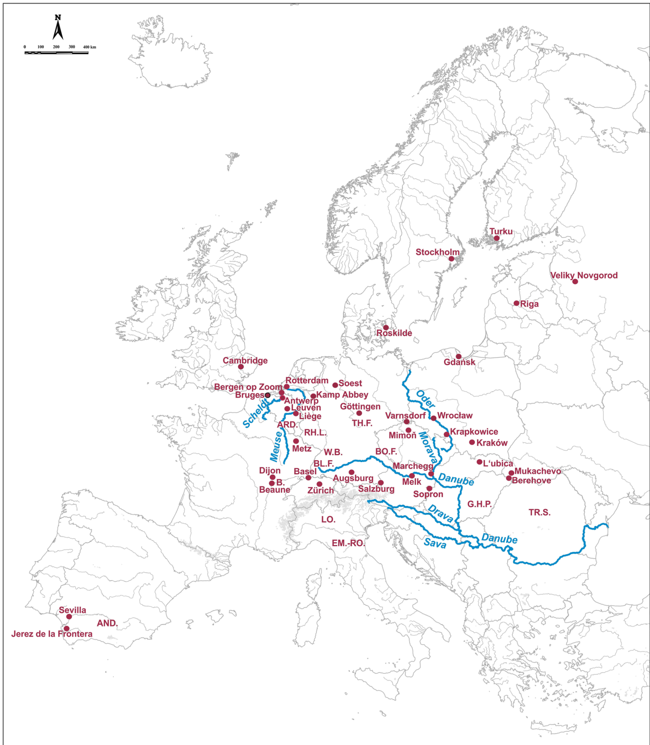
Fig. 1 Map with locations, rivers and areas mentioned in the sources. Areas: Ardenne (ARD.); Rhineland (RH.L.); Black Forest (BL.F.); Burgundy (B.); Baden Württemberg (B.W.); Lombardy (LO.); Emilia-

Romagna (EM.-RO.); Andalusia (AND.); Thuringian Forest (TH.F.); Bohemian Forest (BO.F.); Great Hungarian Plains (G.H.P.); Transylvania (TR.S)