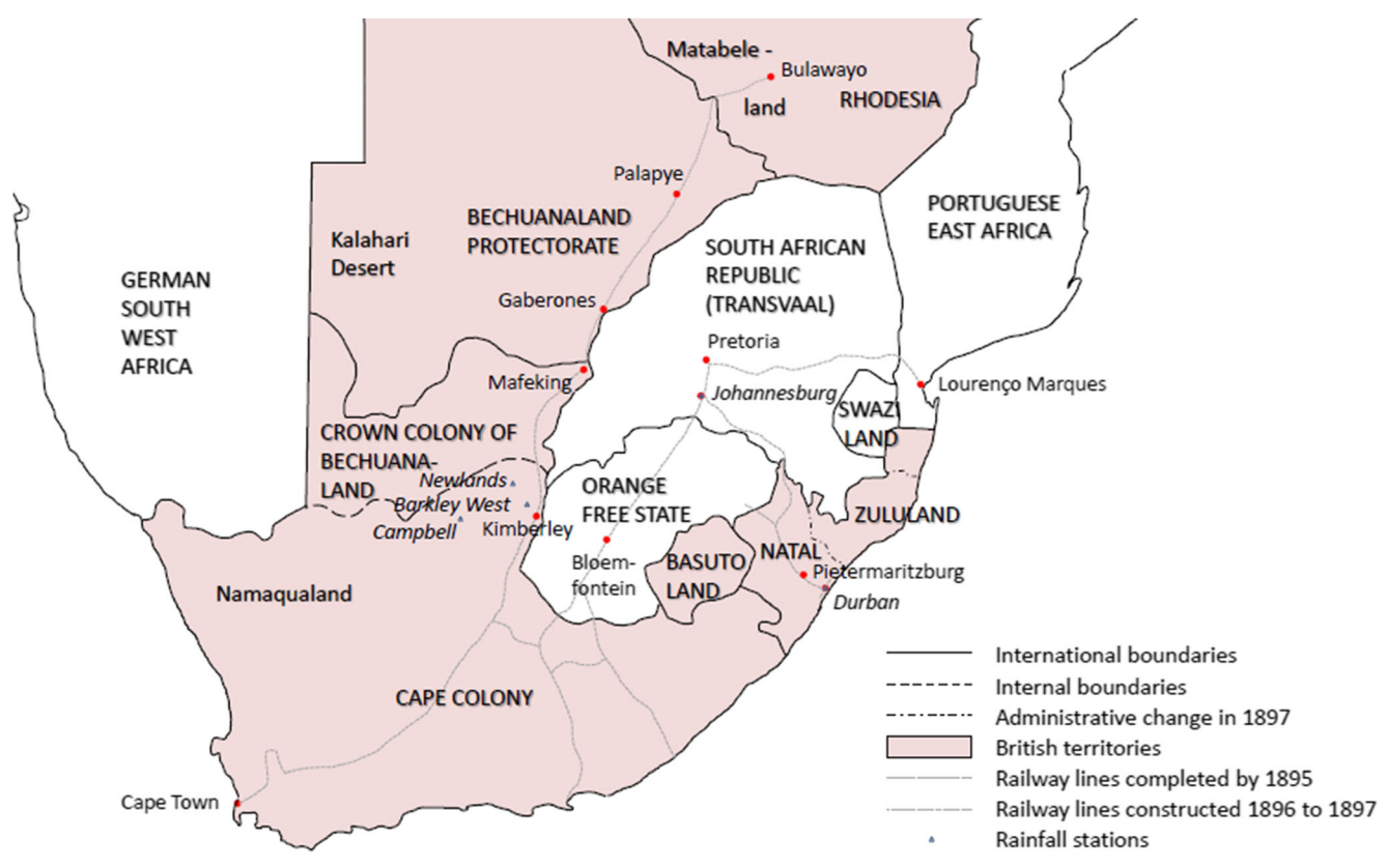
Fig. 1. Administrative boundaries and railway lines in southern Africa, 1895–98. Rainfall stations marked in italics with the locations indicated by triangles. Place names given as in use during the study period

observations from Joubert Park (Johannesburg), and in Rhodesia<sup>2</sup> (Selous 1896). In the last decades of the nineteenth century, meteorological stations were established across the region, but many early instrumental series are incomplete. Missing values are more frequent in these series during the drought years and may indicate a breakdown in administrative reporting. The complete series used in this paper are as follows: Durban (Natal), Joubert Park in Johannesburg (SAR), Campbell (Cape Colony) and Newlands (Cape Colony). Data for Barkly West (Cape Colony) are missing between August 1896 and May 1898 but available for the early and late parts of the crisis. These series were obtained from the Global Historical Climatology Network dataset (GHCN) version 3 (Lawrimore et al. 2011).