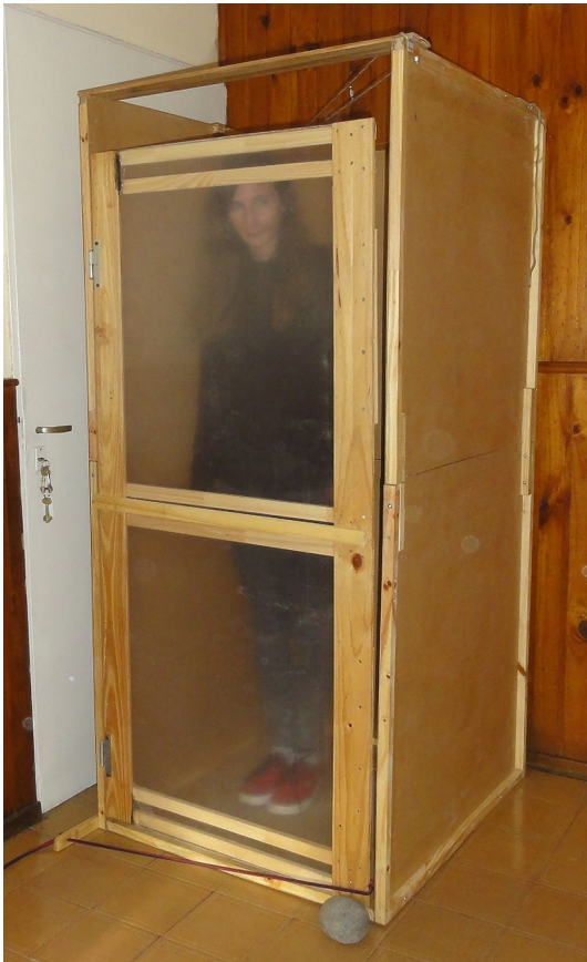
Fig. 1 Photo of the experimental apparatus with the owner inside. The owner expressed his consent to appear in this publication

(See Supporting information Video 1 with an example of an evaluated subject).