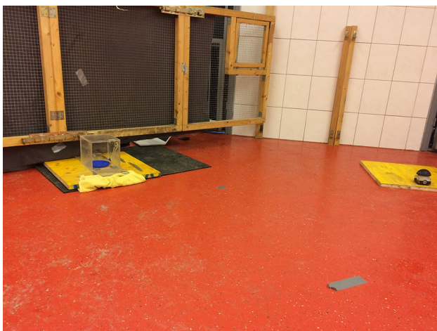
Fig. 4 Setup for buzzer test. The transparent box is located in front of a curtain with an experimenter opening the box from behind the curtain. The buzzer is located at a distance of 2 m

In this test, the animals were confronted with a transparent box (25 × 25 × 25 cm) that contained a piece of sausage and which could be opened by pressing a buzzer (Eaton® FAK-S/KC11/I) located away from the box (side counterbalanced across subjects). The front side of the box could be opened via an opening mechanism (string attached to a latch) from the opposite side of the box (see Fig. 4). The box was positioned in front of a fence covered with a curtain, which served as a visual and physical barrier for a second experimenter that was responsible for opening the box by pulling the string, as soon as the buzzer was pressed. Both box and buzzer were screwed to separate wooden boards to enhance stability.