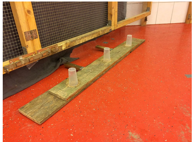
Fig. 2 Setup for middle cup test

The middle cup tests consisted of a repeated choice between three transparent plastic cups (height: 15 cm) of which only two were baited with dry food. The cups were aligned on a wooden board (160 cm with 45 cm distance in-between cups) in notches to enhance their stability (see Fig. 2). The cups were placed in notches in the board. The board could be moved via two sticks from behind a curtain, to allow the experimenter to manipulate the cups without being visible to the animals, and additionally to stabilize the board