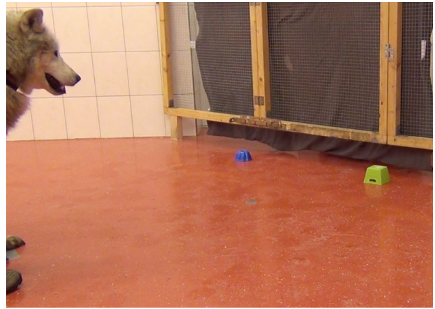
Fig. 3 Objects used for reversal learning test arranged in front of the curtain at the beginning of a trial. The wolf is held at the starting position

This test was preceded by a warm-up phase in which the animals were presented with only the positive object (S+), to facilitate the learning process. For half of the subjects, the green plastic object was set as S+, whereas for the other half the blue cake tin was set as S+. The assignment to either group was random but counterbalanced across subjects. The experimenter showed the subject the piece of reward (sausage) by lifting the hand with the reward in front of the