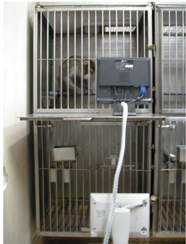
Fig. 1 A monkey's home cage was divided into two compartments, and a touch-sensitive display was attached to each compartment. During the experiment, the monkeys were allowed to move between the compartments and to touch the displays

The stimuli were 21.1 cm \times 14.2 cm digitized color movies (720 \times 480 pixels, MPEG 1—Layer 2 files) (Fig. 2). They did not include sound. The duration of each movie was 9.5 s. Each stimulus set was composed of 10 movies showing humans and 10 movies showing animation characters, because the monkeys showed preferences for these movies in our previous experiments (Ogura and Matsuzawa, unpublished data). The humans in the movies were novel persons for the monkeys. The behaviors of the