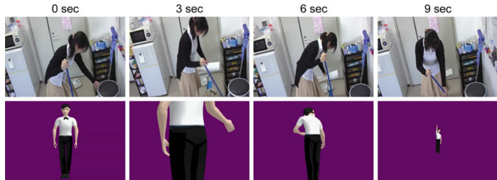
Fig. 2 Examples of the stimulus movies. These photographs show the images at 0, 3, 6, and 9 s from samples of a human movie and an animation movie

humans in the movies were walking, working, and conversation with another human. Computer-generated humans were used as the animation movies. The backgrounds of the characters were plain vivid colors. I used four sets of stimuli, and therefore, the total number of stimuli was 80.