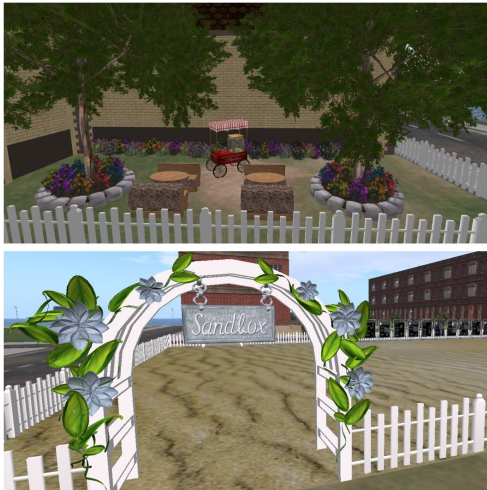
Fig. 3 Leisure-meeting area and the sandbox for experimentation with 3D modelling instructions