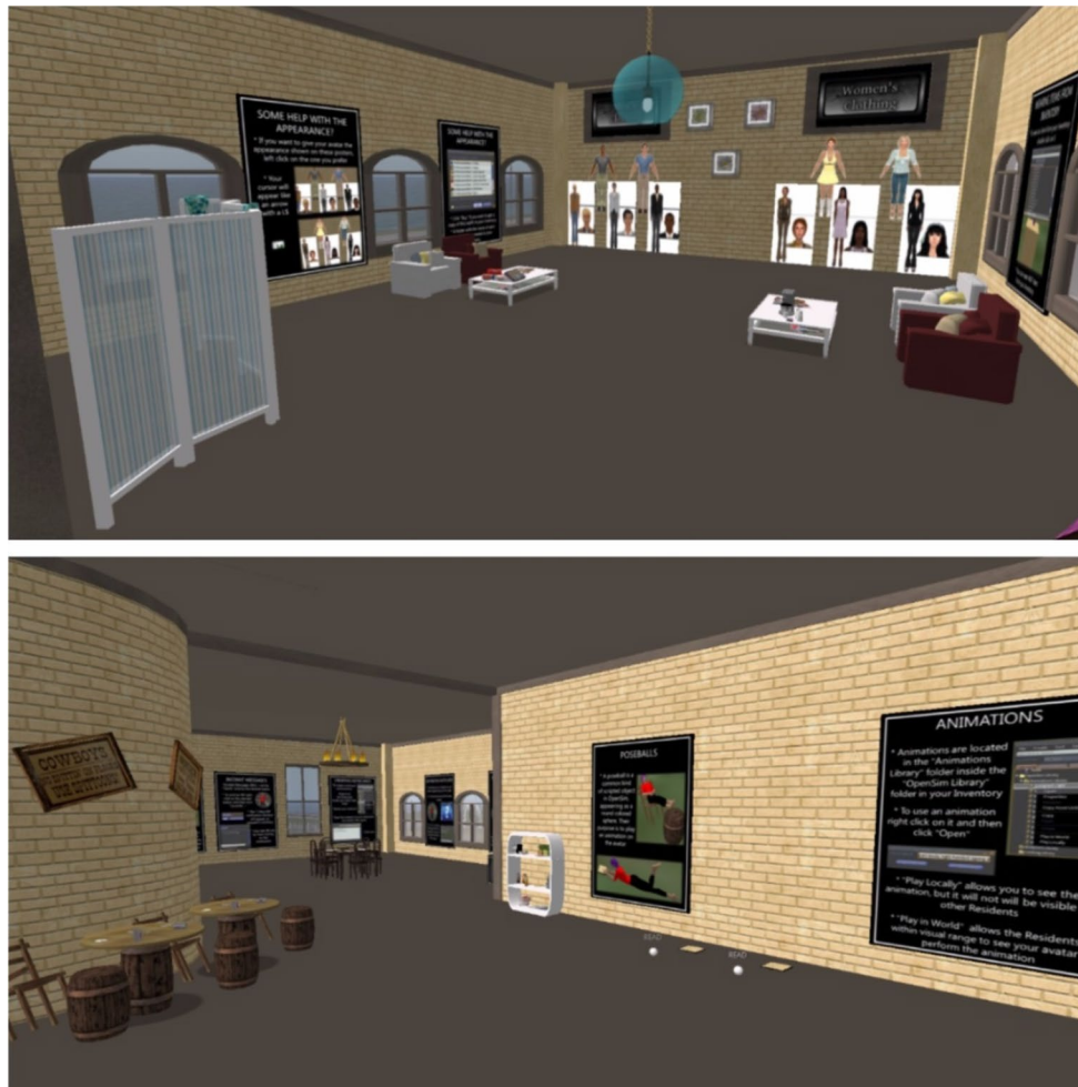
Fig. 2 Rooms inside the orientation building with information about the virtual world and its tools