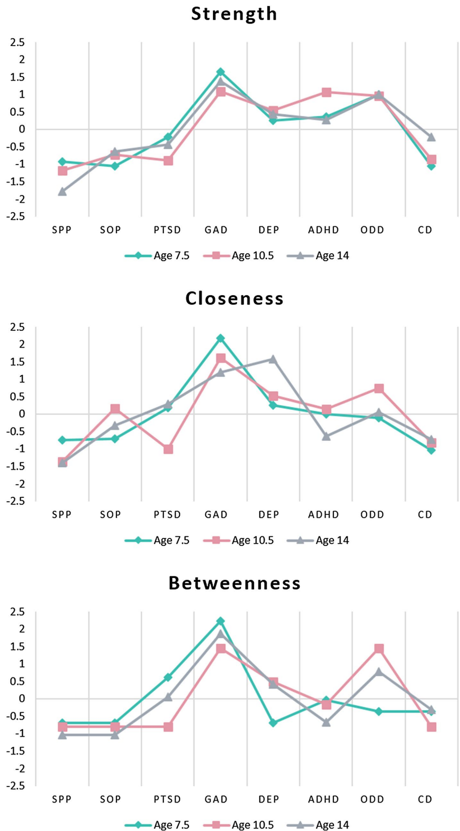
Fig. 2 Centrality statistics for association networks at the three time points. SPP specific phobia, SOP social phobia, PTSD post-traumatic stress disorder, GAD generalized anxiety disorder, DEP major depression, ADHD attention deficit hyperactivity disorder, ODD oppositional defiant disorder, CD conduct disorder. Centrality values (y axis) presented as z-scores