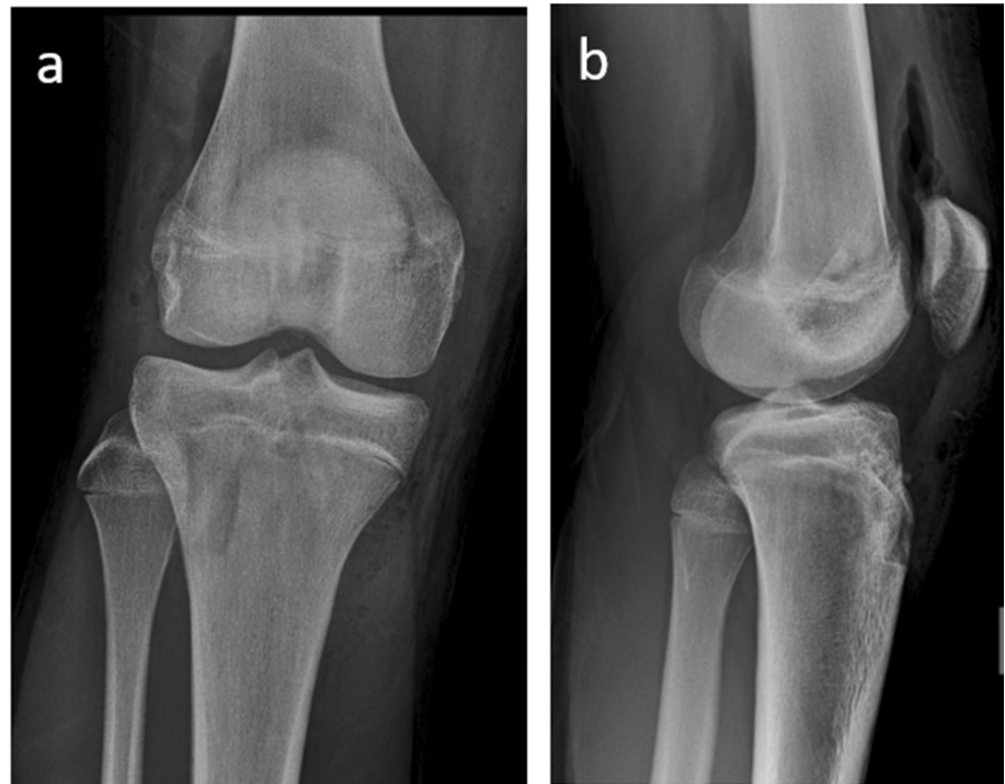
Fig. 1 Postoperative X-rays of ACL reconstruction with BPTB in 15-year-old boy male. Anterior–posterior (a) and lateral (b) X-rays of the right knee show open physes and tunnels

tear” AND “young” AND “BPTB”, (g) “ACL injury” AND “young” “patellar tendon”, (h) “ACL tear” AND “young” AND “patellar tendon”, (i) “ACL reconstruction” AND “skeletally immature” AND “patellar tendon”, (l) “ACL reconstruction” AND “skeletally immature” AND “BPTB”, (m) “ACL reconstruction” AND “young” AND “BPTB”, (n) “ACL reconstruction” AND “children” AND “BPTB”, (o) “ACL reconstruction” AND “adolescent” AND “BPTB”, (p) “ACL injury” AND “children” AND “BPTB”, (q) “ACL injury” AND “adolescent” AND “BPTB”.