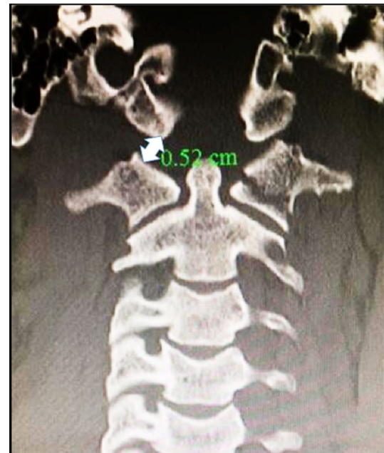
Fig. 3 Coronal CT view of a representative case demonstrating the value of the condyle-C1 interval; values of more than 2 mm are suggestive of OCD >

Plain X-rays are notoriously inadequate in diagnosing cranio-cervical injuries [18]. CT scans are the imaging modality of choice [5, 12, 20, 27, 28]. There is no consensus on what diagnostic criteria are best on CT scans. Different authors have reported different results in their respective series [12, 21, 28]. Dahdaleh et al. [8] studied the various radiological measures on CT scan and concluded that the modified condyle-C1 interval (CCI) was the most sensitive and reliable diagnostic parameter. This author's work has suggested that the revised CCI ( > 2.5 mm) and condylar sum ( > 5 mm) might be more sensitive than the CCI measurement alone on CT (Fig. 3). Ravindra et al. [27], Bertozzi et al. [3] and Martinez-Del-Campo et al. [20] have also reaffirmed these observations in pediatric and adult patient populations, respectively. Martinez-Del-Campo and colleagues compared normal with injured cranio-cervical junctions and reported that among the various craniometric parameters