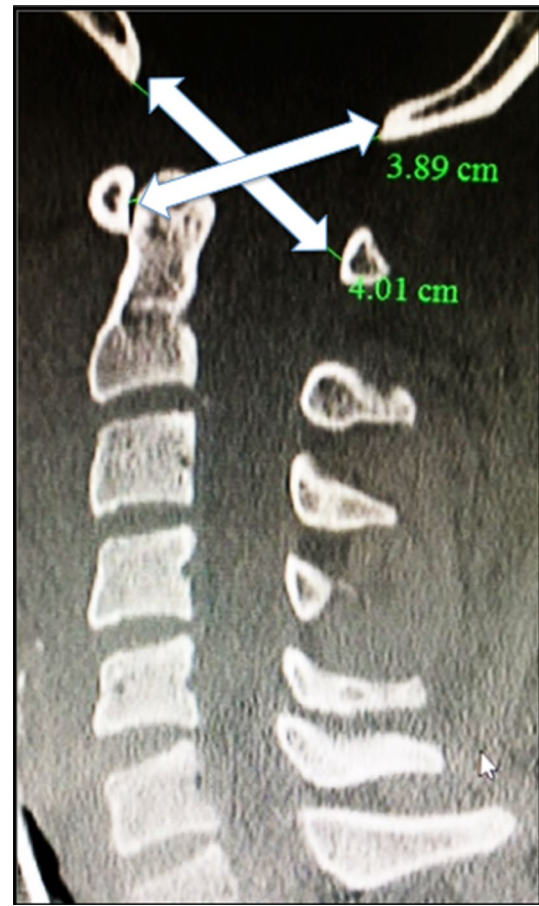
Fig. 5 Powers' ratio measured on the sagittal CT section in the same case

Like the subaxial cervical spine injuries, it might seem tempting to suggest stress imaging (traction or flexion/extension images) to diagnose ongoing instability. Child et al. [6], in his study on cadaveric specimens, have demonstrated that instability manifests as 2-mm distraction can be attained by traction utilizing as little as 5–10 lbs. weight. Nonetheless, given the high morbidity and mortality of these lesions as well as the ethical issues concerning such testing in the clinical scenario, it is at best recommended in very selected situations.