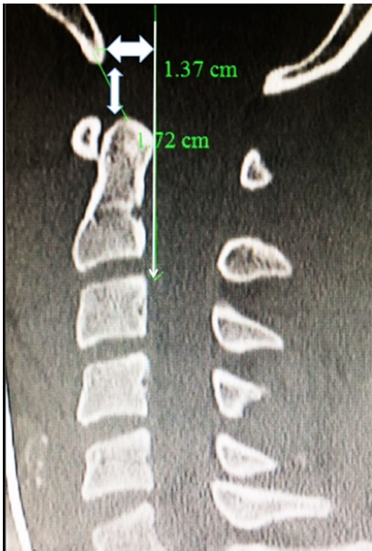
Fig. 4 Sagittal CT section illustrating the technique of measuring the Basion-Dens interval and basion-axial interval

cadaveric study, have suggested that the transverse and alar ligaments are more critical than the capsule of the atlanto-occipital joint [26]. Debernardi et al. [9] have recommended the usage of an MR-based scoring system to determine instability and decide on surgical fusion. Roy et al. [29] also suggest that the rule of Spence intended to diagnose transverse ligament injury is often inadequate for this purpose and that MRI appeared to be the best tool to diagnose ligament injuries in this location. Needless to say MRI has been increasingly used for cranio-cervical trauma in recent years, and the optimal criteria for the diagnosis of CCD lesions are yet to evolve. Vilela et al.'s [31] study has recorded up to 50% vascular lesions picked up on angiographic studies in CCD lesions, and they recommend both MRI and angiograms in all cases.