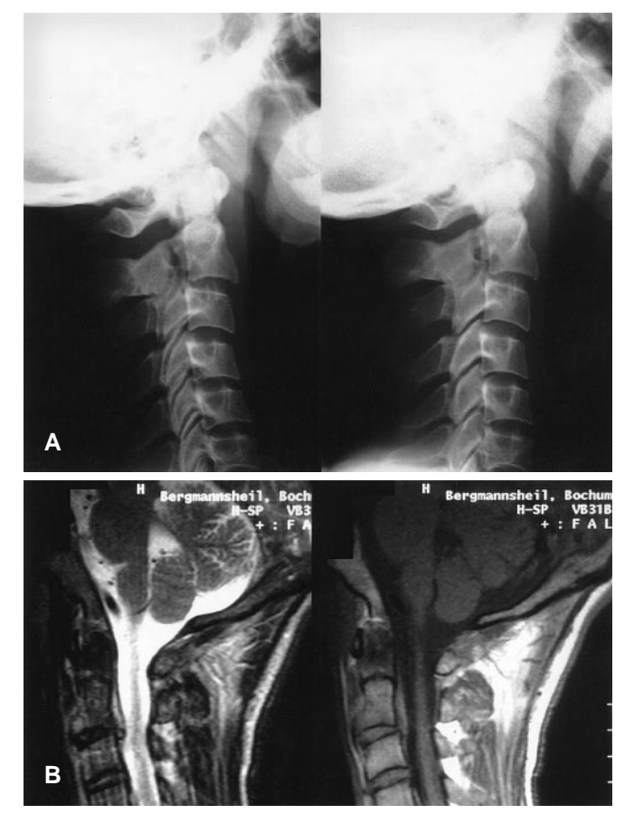
Fig.2 A Lateral flexion/extension views of a type II extension injury with an avulsion fracture of the anterior longitudinal ligament. No radiological signs of instability are apparent. B NMR scan demonstrating the involvement of the intervertebral disc C2/3 and showing the posterior longitudinal ligament to be intact. Also note the haematoma posterior to the axis body

reported by others, application of a cervical orthosis is appropriate. In none of the fractures had the position changed until fusion of the fracture was obvious; the C2/3 interspace also remained unchanged until fusion.