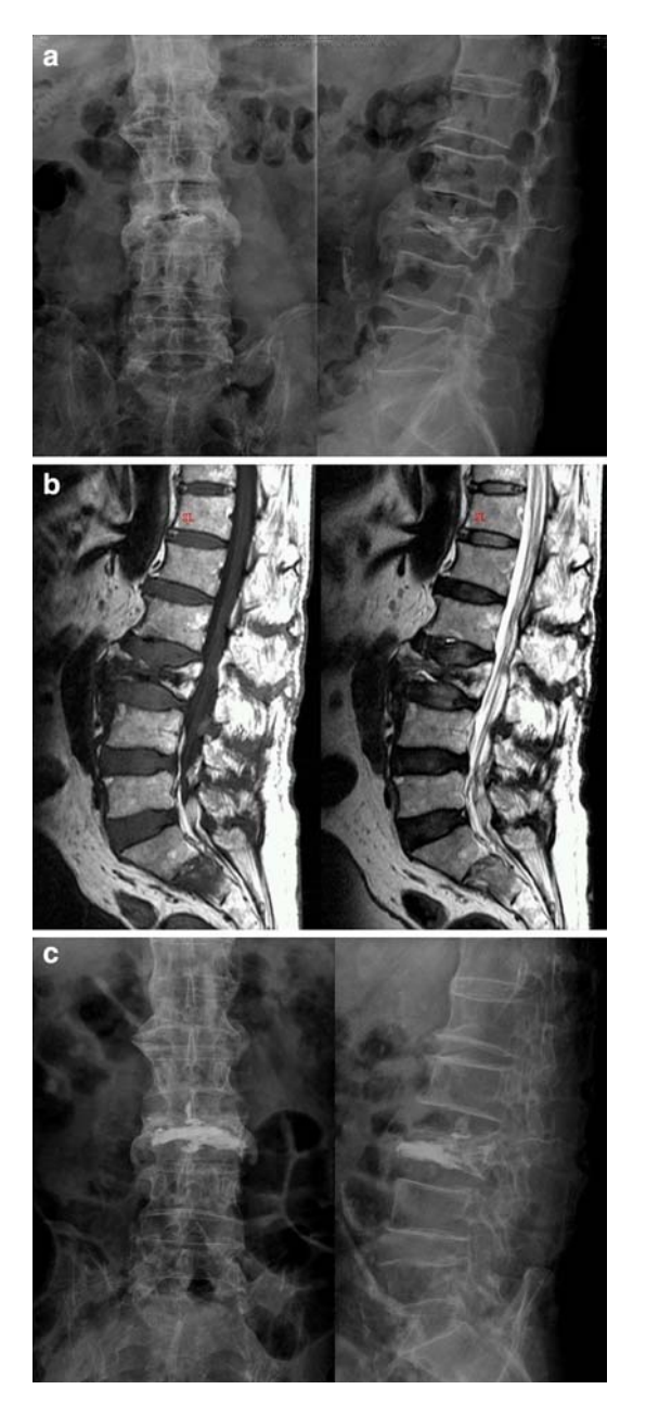
Fig. 2 An 85-year-old woman sustained recurrent back pain after a short period of pain relief. a Radiography showed a L3 osteoporotic compression fracture after vertebroplasty with bone cement. b Sagittal MRI demonstrated residual vacuum in the L3 vertebral body. c Postoperative radiography revealed good augmentation of the L3 vertebral body after repeat vertebroplasty

vertebroplasty site is the dynamic nature of vertebral fractures with clefts [21, 22, 37]. Clefted vertebral fractures can be lined by fibrocartilage forming intervertebral pseudoarthroses, providing a potential space for infection. Intervertebral deep infection is very difficult to eradicate due to its poor vascularity and hence inaccessibility to systemic antibiotics. Therefore, anterior extensive debridement and associated autogenous bone grafting, combined with