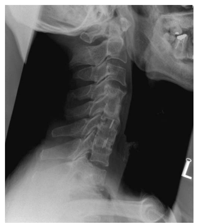
Fig. 3 Lateral X-ray at 5 months after the revision surgery. Solid fusion at all levels and obliteration of the pre-vertebral soft-tissue shadow can be seen

from 0 to 1.1%. The use of metal implants may increase the possibility of infection [4]. Discitis is a known complication of cervical discography [2, 11]. Occasional