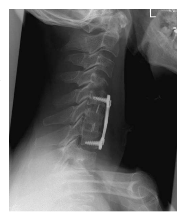
Fig. 1 Lateral X-ray of cervical spine at 6 weeks after index surgery. Persistence of pre-vertebral soft-tissue shadow, erosion and irregularity of C4 and C5 end plates apart from segmental kyphosis and loosening of screws can be seen

The patient underwent an aggressive surgical debridement and stabilization through a left-sided approach. The loose screws and the plate were removed. A thorough decompression of the epidural abscess along with surgical debridement of C4–5 disc space was performed. No pus or evidence of infection was seen at the C5–6 and C6–7 levels and the cages were left behind as they appeared stable and secure. Tricortical iliac-crest