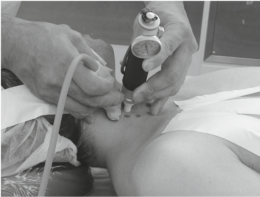
Fig. 2. Measurement of the compressive force required to collapse the right internal jugular vein (RIJV). While manual compression was applied with the head of a spring-type force gauge placed perpendicularly on the skin surface at the assumptive puncture point, collapse of the RIJV under the force gauge was observed in an ultrasound image obtained with an ultrasound probe placed at the cephalad side of the force gauge