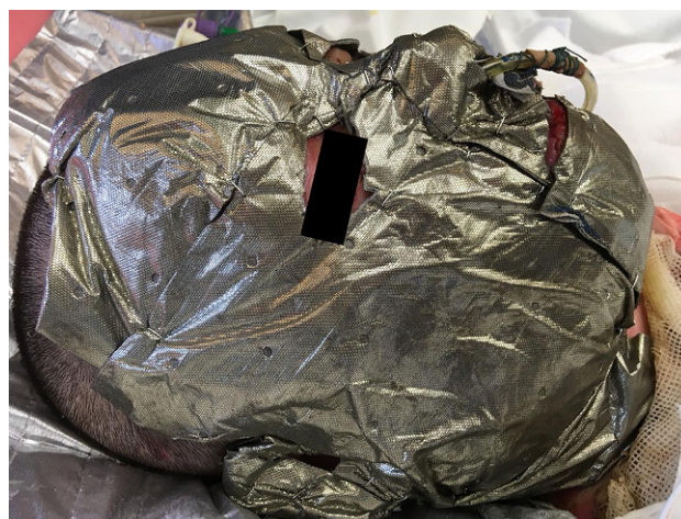
Fig. 1 Applied Acticoat7™ mask fixed with skin staples

This retrospective study analyzed data from all patients with superficial and deep partial thickness facial burns treated at the 6-bed intensive care unit (ICU) of the Vienna General Hospital between 2008 and 2017. All patients included were treated with Acticoat7™, a wound dressing containing nanocrystalline silver. The data were obtained from scanned patient charts. Approval from the local ethics committee (No. 1183/2017) was obtained. Patients transferred to the burn unit after initial treatment at external hospitals, patients who died during the course of treatment and patients suffering from third degree facial burns were excluded. The primary endpoint was determined as