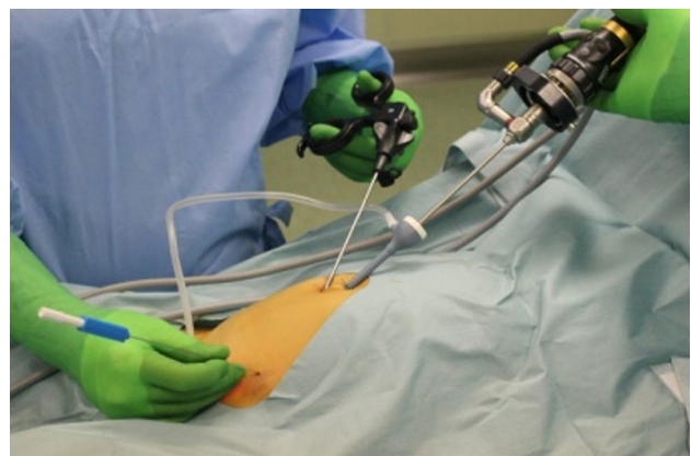
Fig. 1 A camera port and a grasping forceps are inserted through the same umbilical incision

OR was performed according to the technique described by Potts et al. [10], which was simple high ligation and possible removal of the hernial sac without elevating the structures of the cord, and without any plastic repair of the muscles or fascia of the inguinal region. Indirect sliding inguinal hernias of the ovary or tube were repaired based on the procedures described by Woolley [11].