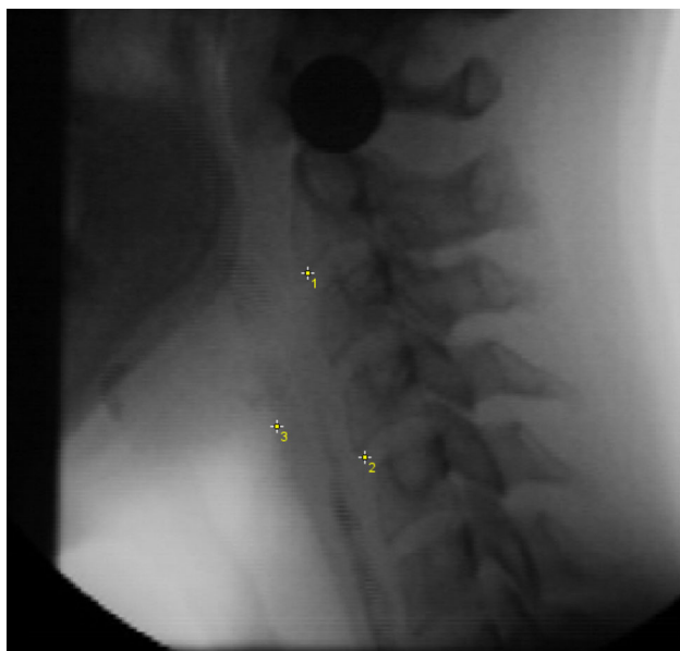
Fig. 2 Pharyngeal shortening measurement example. Peak laryngeal position (point 3) from C4 (point 2) in a participant-defined coordinate system ( Y -axis through points 1 and 2)

measures of interest. Swallowing events included: bolus past mandible, hyoid burst (rapid upward and forward motion), hyoid rest, onset laryngeal closure, offset laryngeal closure, UES opening, and UES closure. Relevant events are subtracted from each other to derive our six temporal measures of interest. Finally, we convert the frames to seconds. A summary of the temporal variables appears in Table 2. Detailed procedures and operational definitions are described in detail in Molfenter & Steele [27]. If clearing swallows were present, temporal measures were taken from the initial swallow only.