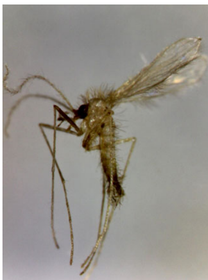
Fig. 3 A male of Phlebotomus (Transphlebotomus) mascittii captured in Rohrau, Lower Austria (Orig.)

by combining their dispersal abilities with climatic prospects, projected sandfly establishment of species with current south-eastern focus ( P. neglectus , P. perfiliewi ) in eastern Austrian regions neighbouring Slovenia and Hungary in the near future (Fischer et al. 2011). In that study it was further projected that P. ariasi and P. mascittii would disperse to south-eastern parts of Austria and would be able to occur in eastern and north-eastern parts at the end of the twenty-first century (Fischer et al. 2011). Thus, it appears surprising that in the present study (1) P. mascittii and not P. neglectus was found in Eastern Austria and that (2) P. mascittii has obviously already established also in the north-eastern parts of Austria. However, the cited projections were based on the assumption that Austria was free of sandflies, and sandflies would invade the country from neighbouring countries. Today, all records of sandflies in Central Europe, including Austria, are considered to represent remnants of warmer periods in Central Europe and not to be associated with a recent immigration due to climate change and