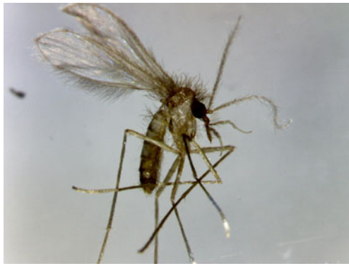
Fig. 2 A female of Phlebotomus (Transphlebotomus) mascittii captured in Rohrau, Lower Austria (Orig.)

by combining their dispersal abilities with climatic prospects, projected sandfly establishment of species with current south-eastern focus ( P. neglectus , P. perfiliewi ) in eastern Austrian regions neighbouring Slovenia and Hungary in the near future (Fischer et al. 2011). In that study it was further projected that P. ariasi and P. mascittii would disperse to south-eastern parts of Austria and would be able to occur in eastern and north-eastern parts at the end of the twenty-first century (Fischer et al. 2011). Thus, it appears surprising that in the present study (1) P. mascittii and not P. neglectus was found in Eastern Austria and that (2) P. mascittii has obviously already established also in the north-eastern parts of Austria. However, the cited projections were based on the assumption that Austria was free of sandflies, and sandflies would invade the country from neighbouring countries. Today, all records of sandflies in Central Europe, including Austria, are considered to represent remnants of warmer periods in Central Europe and not to be associated with a recent immigration due to climate change and