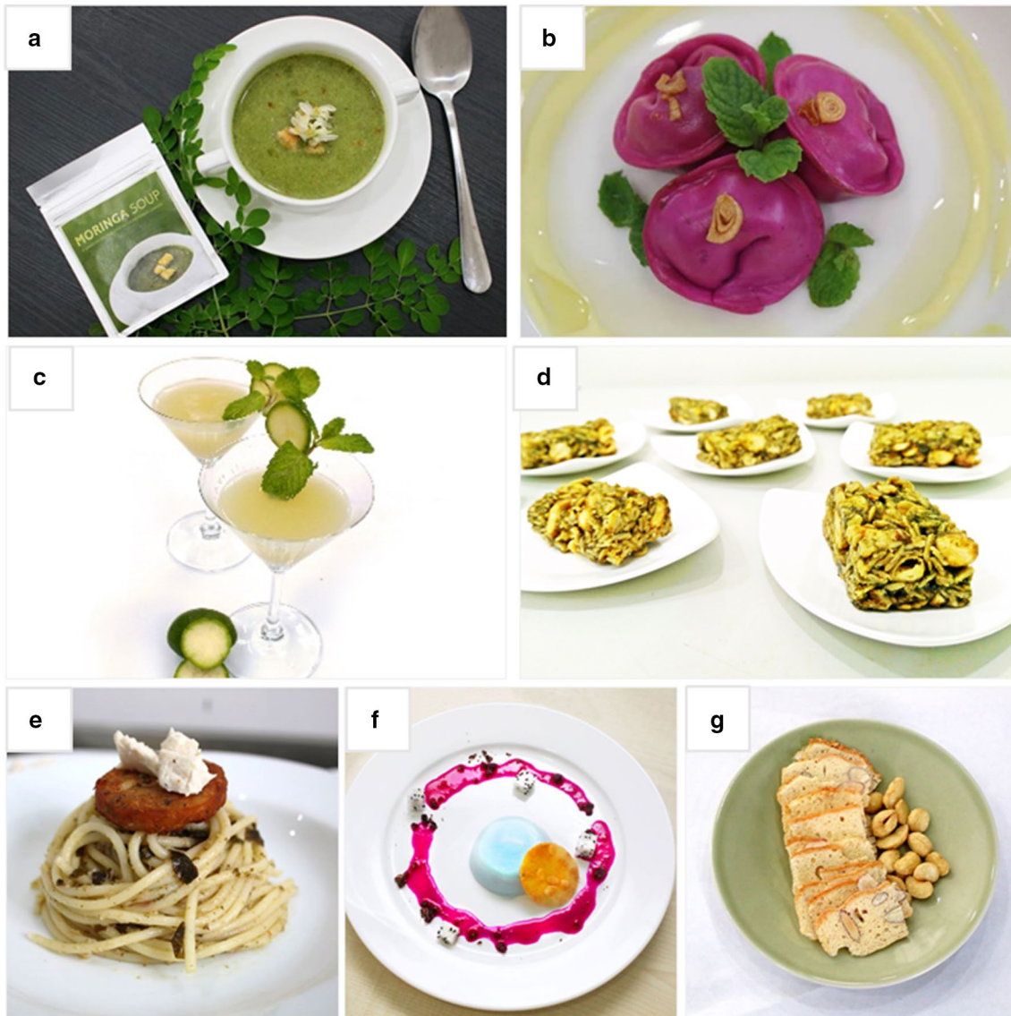
Fig. 2 Food and beverage products developed at CFF using moringa, Bambara groundnut, dragon fruit and kedondong fruit. a Moringa instant soup, b Dragon fruit tortellini with beans and greens, c

Kedondong ginger ale, d Moringa and Bambara groundnut granola bar, e Bambara groundnut noodle, f Bambara groundnut panacotta and g Bambara groundnut biscotti