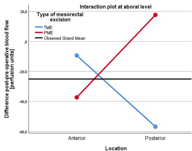
Fig. 2 Interaction between anteroposterior location and type of mesorectal excision at the aboral level, evaluated in the repeated measures ANOVA model ( p = 0.007 ). TME, total mesorectal excision; PME, partial mesorectal excision; PU, perfusion units

significance [22]. Unlike LDF, these techniques are at the present moment qualitative rather than quantitative, rendering reproducibility a problem; as such, the technique is also difficult to use in a study on pathophysiology. In a previous report using LDF, microcirculation changes were analysed in rectosigmoid cancer surgery. The authors found a deterioration in both colonic and rectal perfusion, while the rectal stump perfusion decrease was more predictive of anastomotic leakage [8]. While this noticeable rectal microcirculation decrease was also found in the current study, the above study did not differentiate between TME and PME surgery. Interestingly, it was shown in an angiographic study that the lower rectum has a less developed arterial collateral network compared to the upper part. Of note, the authors showed that