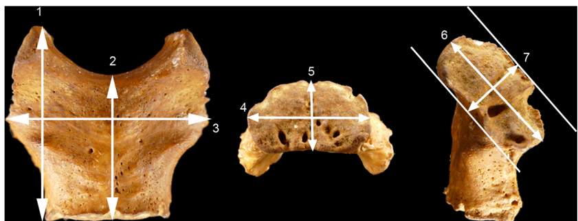
Fig. 1 The locations of the measurements on the pars basilaris

The results obtained for the validation of the methods proposed by Fazekas and Kósa [7] and by Scheuer and McLaughlin [8] are shown in Table 3. Significant