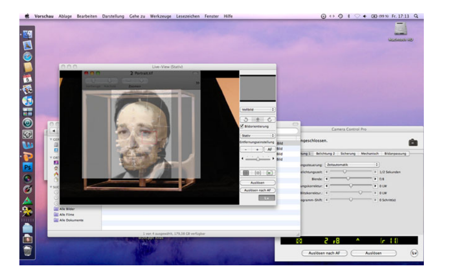
Fig. 1 Screenshot with Camera Control Pro and Preview software. Semi-transparent depiction through Afloat®

The portrait image and the image of the aligned skull were opened in a common Photoshop CS4 file and were projected on top of each other. The portrait photograph was floated over the skull image in different stages of semitransparency. In this view, the pictures were scaled for size, while keeping the proportions constant. Appropriate scaling of the photographs was determined with the aid of