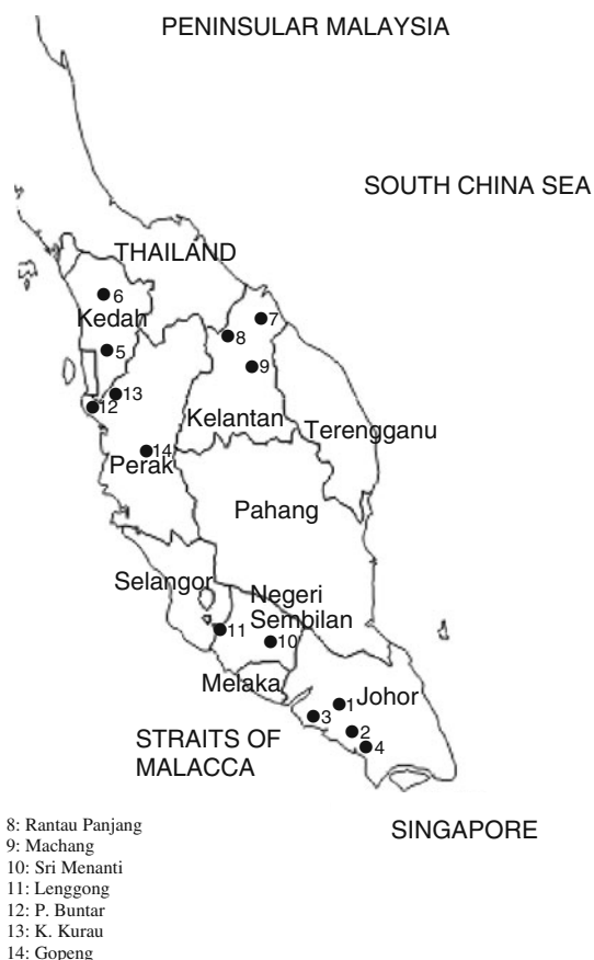
Fig. 1 Map showing specific locations of the Malay samples collected in Peninsular Malaysia. Malaysia (modified from: commons.wikimedia.org/wiki/File:Malaysia_stat )

The “Malaysian Constitution” refers to a Malay as an individual who speaks the Malay language, professes Islam, and follows the Malay customs [12]. In Malaysia, the majority of Malays reside in Peninsular Malaysia. Previous studies have shown that the “Constitutional” Malay race comprises a population admixture of different populations