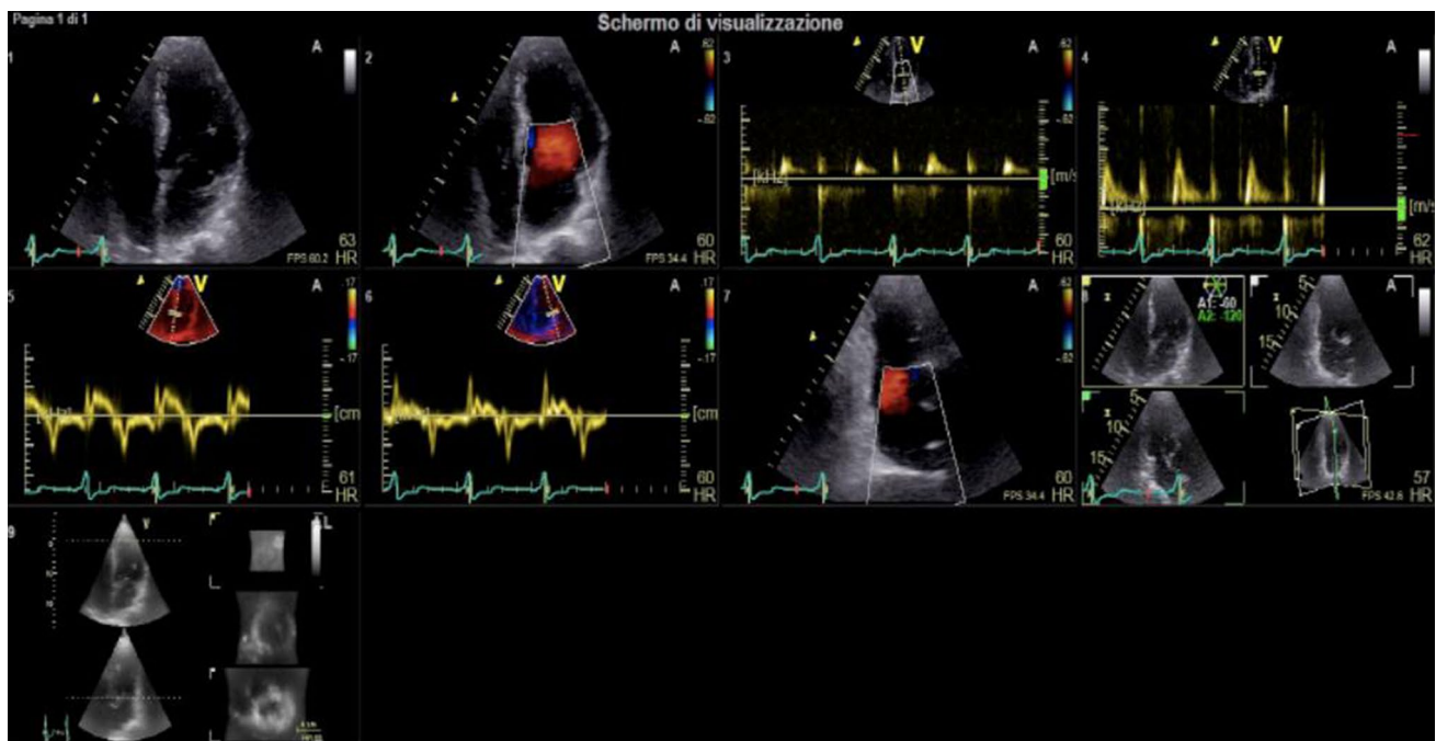
Fig. 1 Dataset of echocardiographic acquisitions. Panel of different echocardiographic acquisitions with 2D and 3D probe

tissue Doppler imaging [4 (3–5) cm/s)]. At this stage, we assumed that atrial phasic functions could be computed as reservoir: maximum LAV – minimum LAV ( LAV_{max} - LAV_{min} ),