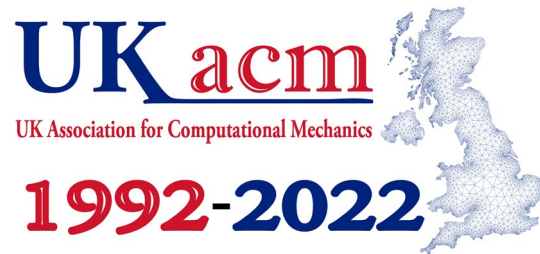
Fig. 18 The UKACM logo designed to commemorate the 30th anniversary