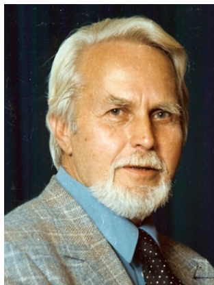
(a) Olgierd C. Zienkiewicz