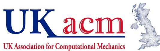
Fig. 13 UKACM logo designed after the rebrand of the Association