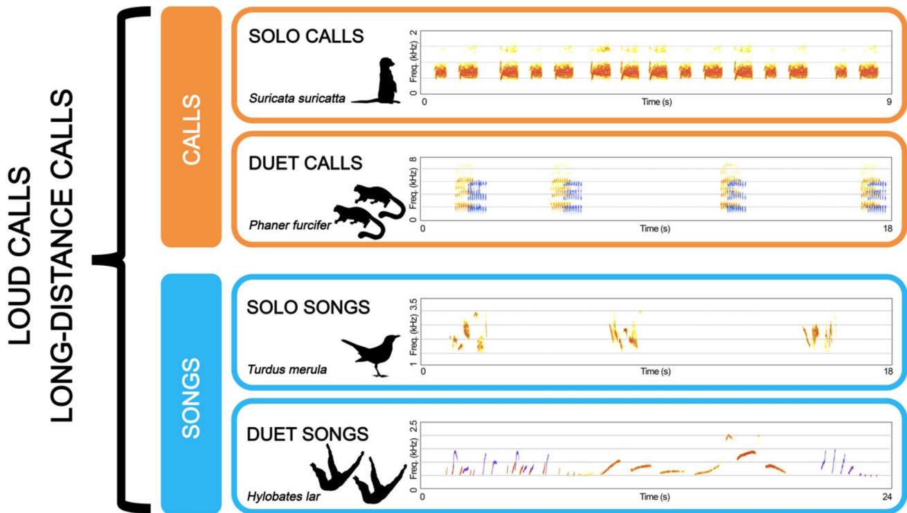
Fig. 1 Spectrogram of the types of vocalizations that can be considered as loud calls or long-distance calls. Different colors represent sounds emitted by different individuals

the most fascinating displays of animal vocal communication, there is no consensus on their functions. Therefore, we reviewed the available literature on the function of duets in non-human primates, investigating a possible link between the social organization of the species and the function of its duetting behavior.