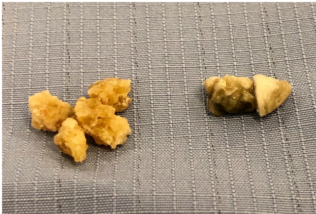
Fig. 3 Stone extracted at time of PCNL. The stone on the left was from the area in Fig. 2a and has the typical appearance of cystine. This was predominantly cystine on analysis. The stone on the right (from the area in Fig. 2b) has different appearance and was calcium phosphate on analysis without a cystine component

Furthermore, HU cannot yet reliably differentiate rough and smooth cystine stones in vivo , and therefore cannot be used to identify stones susceptible to extracorporeal shockwave