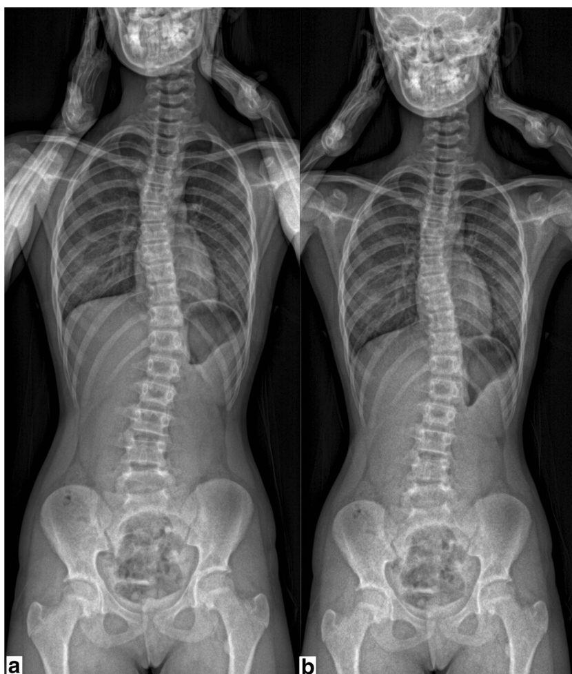
Fig. 3 a Coronal full-spine image in EOS scanner using micro-dose protocol. b Coronal full-spine image in EOS scanner using reduced micro-dose protocol

difficult to visualize because of increased vertebral rotation. Other anatomical landmarks such as vertebral endplates and pedicles were not affected to the same degree. Tables 3 and 4 show results on 3D repeatability and reproducibility along with results from previously published papers. Both micro-dose and reduced micro-dose showed good reproducibility;