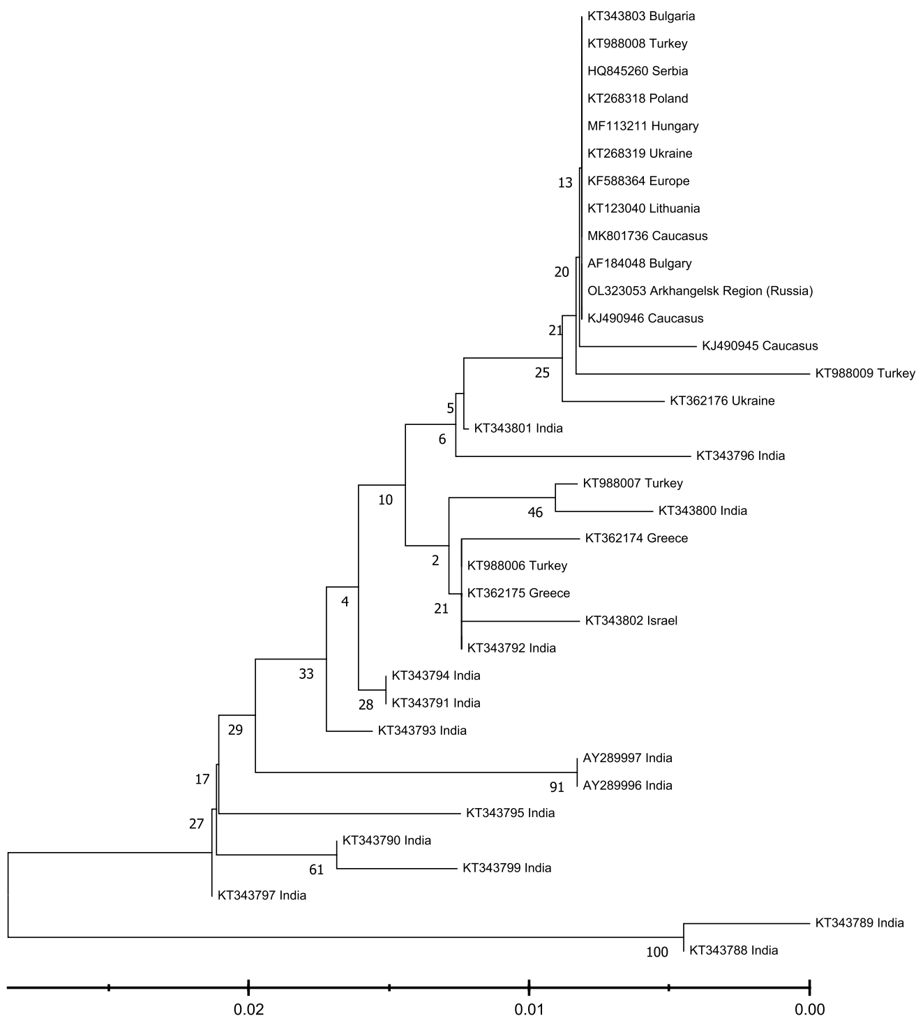
Fig. 3 Neighbor-joining tree based on 240-bp sequences of mtDNA CR from our study (OL323053) and GenBank. The percentage of replicate trees in which the associated taxa clustered together in the bootstrap test (1000 replicates) is shown next to the branches. The tree is drawn to scale, with branch lengths in the same units as those

of the evolutionary distances used to infer the phylogenetic tree. GenBank accession number KF588364 with location “Europe” includes fragment of 450 bp of the hypervariable domain of the mtDNA CR1 from 120 golden jackals collected in Bulgaria, Croatia, Serbia, and Italy