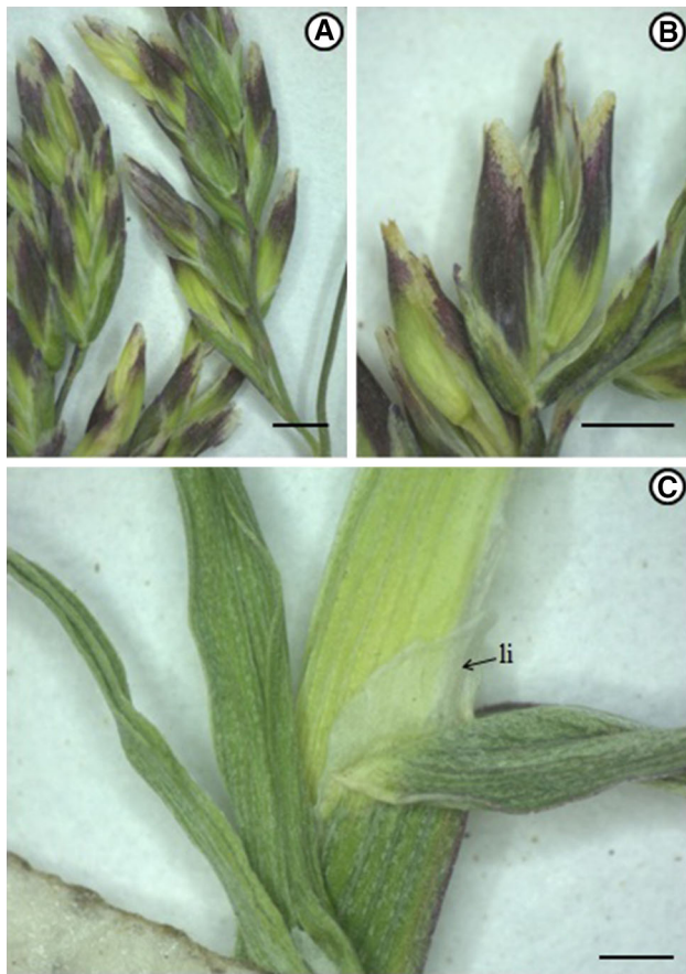
Fig. 2 Reproductive and vegetative morphology of Poa annua growing close to the Chilean Antarctic base “Gabriel González Videla”, Paradise Bay, Antarctic Peninsula. a Inflorescence. b Spikelets. c Leaf blades and ligule (li). All from Molina-Montenegro and Torres-Díaz (CONC-CH). Scale bar 1 mm

When considering the shorter distance of dispersion (132 cm), P. annua reached ca. 2 % of presence in the site compared with the natives D. antarctica and/or C. quitensis , but when longer distances of dispersion are considered (264 and 528 cm), P. annua reached ca. 12 and 40 %, respectively (Fig. 3). The pattern found suggests that the probability to colonize and spreading of P. annua increases notoriously with the possibility of dispersion of propagules of this invader species, with consequent risk of displacement for the native flora (Fig. 3).