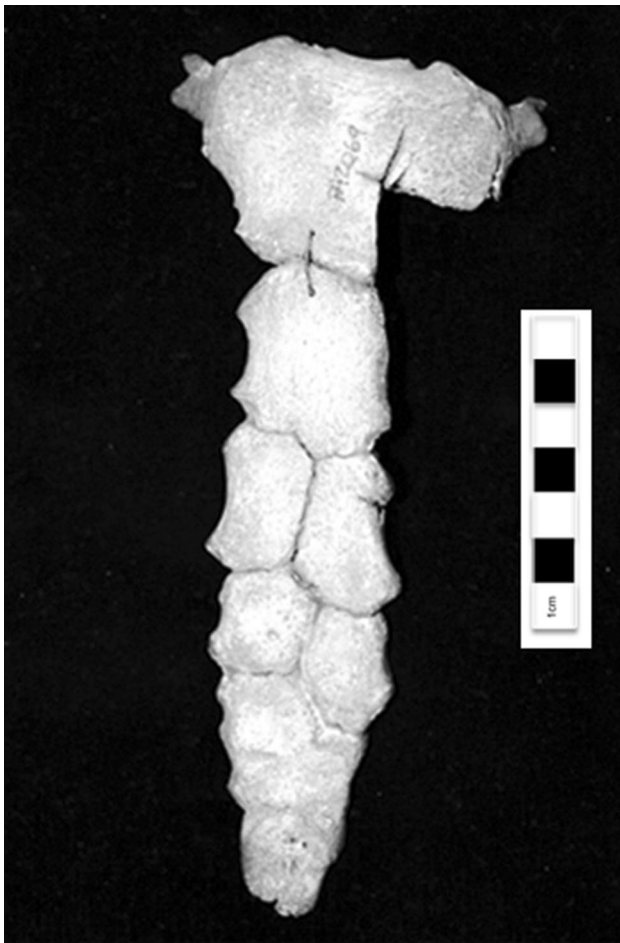
Fig. 2 Human sternum with unfused accessory ossification centres in the mesosternum. Photograph of the anterior view of an adult human sternum including the manubrium, mesosternum, and ossified xiphoid process as well as ossified costal cartilage on the superior lateral aspects of the manubrium

several more unique cases such as a trifurcate xiphoid process, and an individual with three foramina in their xiphoid [18]. However, none of these previous, extensive, clinical reviews have identified individuals with developmental abnormalities similar to those reported here. The closest example that could be found in the literature was briefly described by Knox [8] (see Fig. 3) while commenting on the apparent frequency in which this developmental abnormality is found in specimens of Pongo [12, 15]. It consists of the sternum of an adult male human, with the second, third, and fourth mesosternal sternebrae each being separated into two segments.