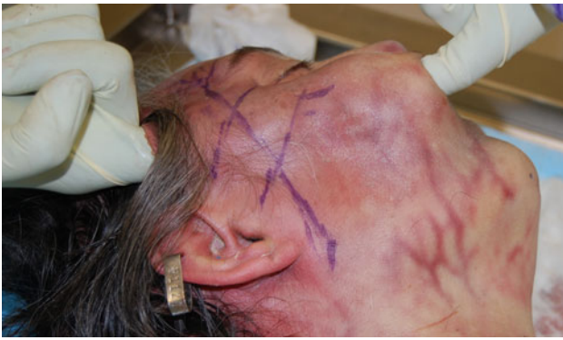
Fig. 2 Confirmation of sufficient communication between the temporal and intraoral dissections by passing fingers between the two planes of dissection

With the dissection and exposure completed, open visualization via the intraoral approach is used to divide the orbital septum. Gentle pressure over the globe with a finger is used to evaluate the amount of bulging and herniation of postseptal fat (Fig. 3). Gorney or long-handled Stevens scissors are used to divide the septum just above the arcus marginalis transversely along the entire length of the orbital rim. Lateral, central, and medial fat pockets are easily teased from their respective compartments using blunt forceps for transposition over the orbital rim (Fig. 4). No fixation is necessary with adequate release.