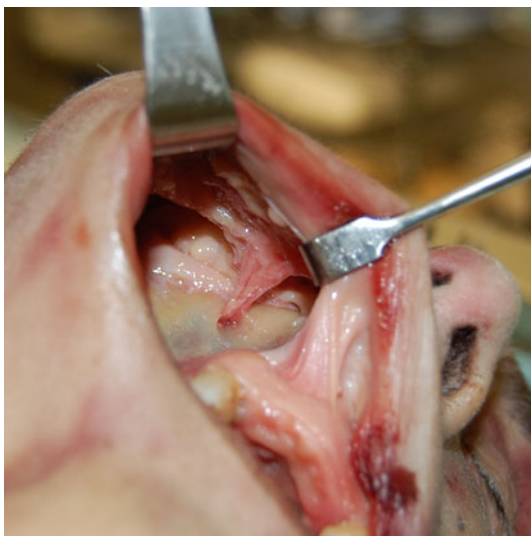
Fig. 3 Postseptal fat is easily visualized through the intraoral dissection

Depending on the surgeon's preference, fixation devices or sutures may be used to accomplish the midface lift at this point with sutures to be secured to the deep temporal fascia in a path over the zygomatic arch. In the presented cases, the author used the Coapt Endotine Midface ST device (Coapt Systems, Inc., Palo Alto, CA) and secured