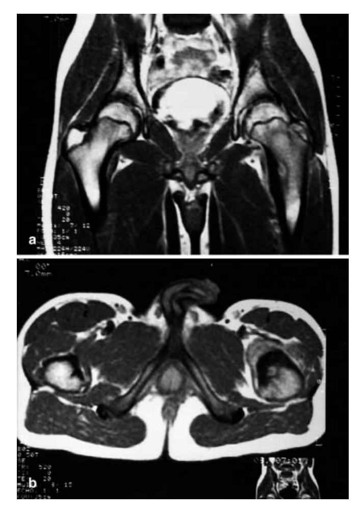
Fig. 4 The nidus and inflammatory response in the surrounding tissues are evident on the coronal T2-weighted ( a ) and transverse T1-weighted ( b ) MRIs

We used the technique of opening the overlying cortex and intralesional excision of the nidus in 80 patients. In 24 who had femoral neck or talar involvement we preferred a limited block resection and grafting.