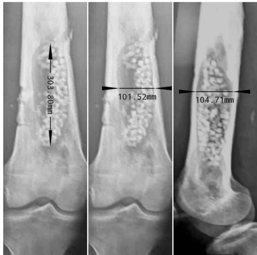
Fig. 2 A clear example of estimating the defect size

will be confronted with two major challenges: first is the management of the dead space that is created after bony debridement and second is how to sterilize and decontaminate the potentially infected surgical field. The dead space left after surgery is an ideal environment suitable for biofilm formation; it will be soon full of haematoma with decreased pH, oxygen concentration and perfusion [9].