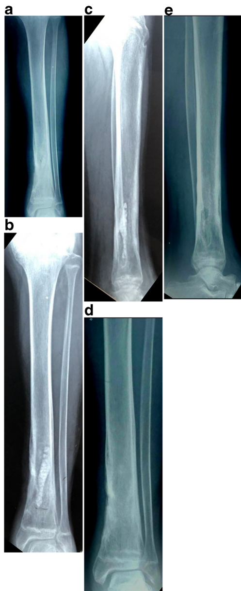
Fig. 3 a AP view of a case of a 19-year-old male patient with chronic osteomyelitis with sequestrum formation after healed open fracture. b AP view 2 months post-operatively showing the pellets before dissolving. c Lateral view 2 months post-operatively. d AP view after 1 year showing defect filling after complete dissolution of the pellets. e The lateral view after 1 year with the small cortical windows still visible

The second priority is helping the osseous repair through providing the scaffold needed for bone ingrowth. In this aspect, calcium phosphates are superior to the \text{CaSO}_4 as it takes more time to dissolve [27–29]. Calcium phosphates and PMMA-loaded antibiotics elute antibiotics over a long time but in concentrations below the MIC of organisms with the risk of biofilm reformation in such cases [9]. By considering the eradication of infection as the first priority before osseous repair, \text{CaSO}_4 is still the best achieving the