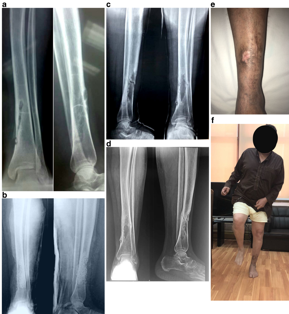
Fig. 4 The same patient shown in the demonstration of operative technique in Fig. 1. a The pre-operative X-rays that show previous bone debridement with incomplete excision of the sequestrum resulted in failure with recurrent infection. b The immediate post-operative X-rays with the pellets filling the defect. c Six months post-operative X-rays showing tibial fracture with the whole \text{CaSO}_4 pellets dissolved with minimal

decrease of the defect size, patient treated with cast. d–f The X-ray and clinical photos after cast removal (9 months post-operative), sinus was closed, patient full weight bearing and the void showed further decrease. However, we prepared the patient for bone grafting as it is much safer to him