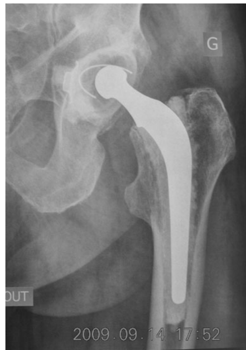
Fig. 4 No detectable wear after 30 years follow-up with original Charnley’s total hip arthroplasty (THA)