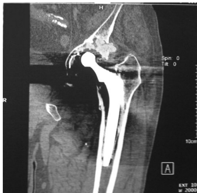
Fig. 2 Bone scan showing wear and loosening of both components after 26 years

One THA was simply removed because of late infection. Forty-four THA were still working with a good functional result. The average wear was between 1 and 3 mm. There were no signs of loosening in either component. Three patients had recurrent dislocations but no revision surgery was performed because of the poor general health. Of these,