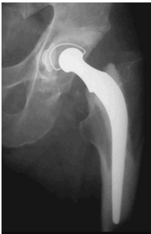
Fig. 3 No cup wear and no radiolucent lines at 30 years follow-up

At the time of that study patients expected age would be between 88 to 113 years old with a median of 104 years (Graph 1).