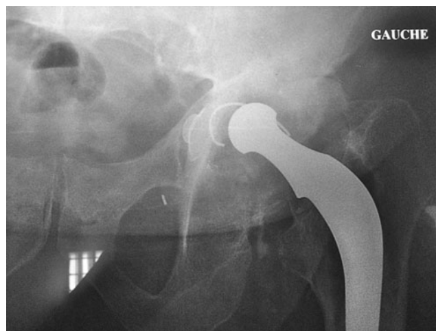
Fig. 1 Significant wear of the cup and femoral component loosening at 28 years post-op

Thirty-nine patients were totally and definitely lost for follow-up. Of these patients according to the patient chart we could see that two THA had been revised and one THA had been removed for deep infection. Information on those patients, excepted the three patients revised, who were lost to follow-up or suspected to have died was collected by mail or phone, extending the contact to the family or the general physician of their country. In 11 cases we were able to obtain information from the family after the patient had died. The replaced hip was still working nicely when the patient died in nine cases. One THA had been